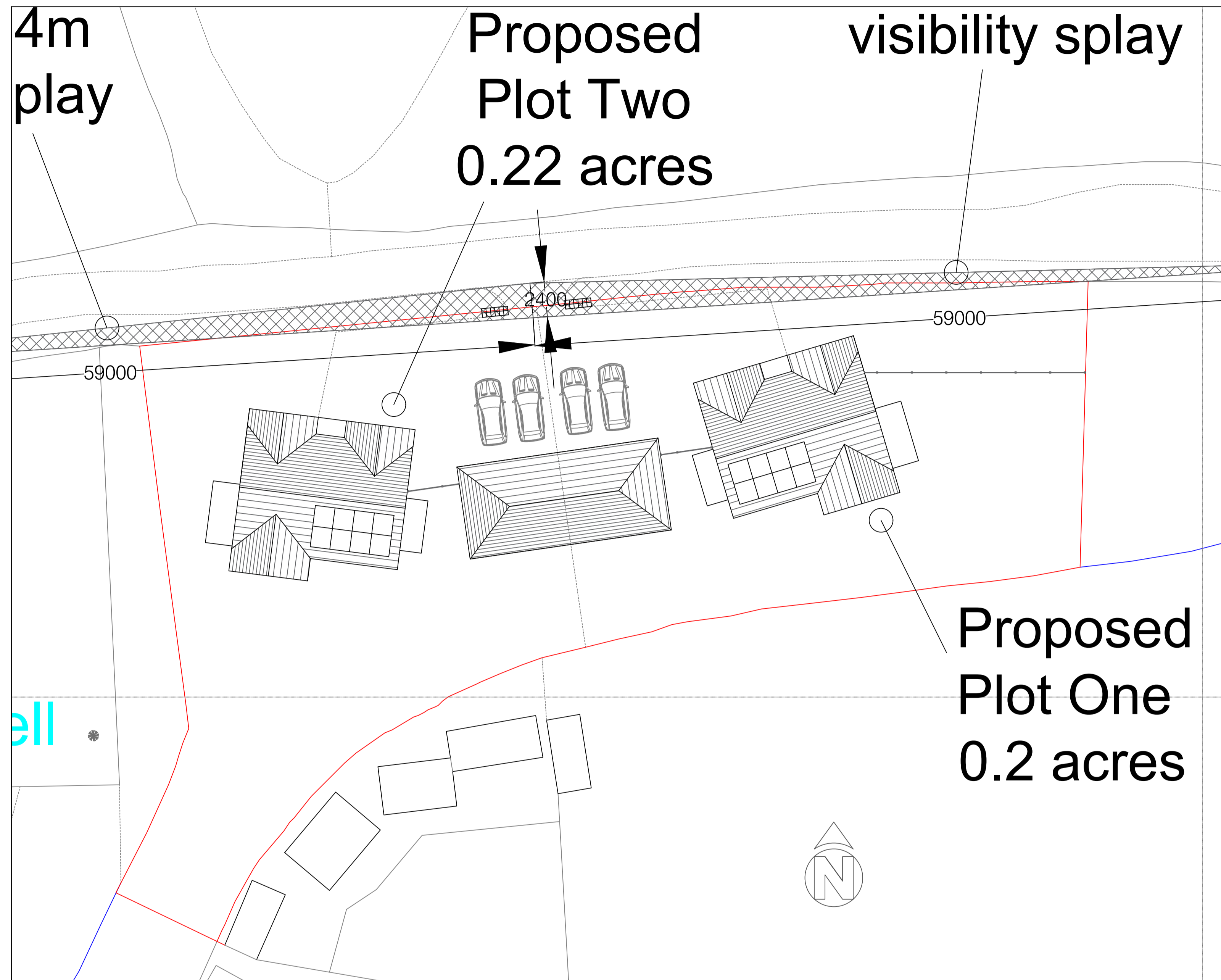
PROPOSED SITE BLOCK PLAN SCALE: 1-200