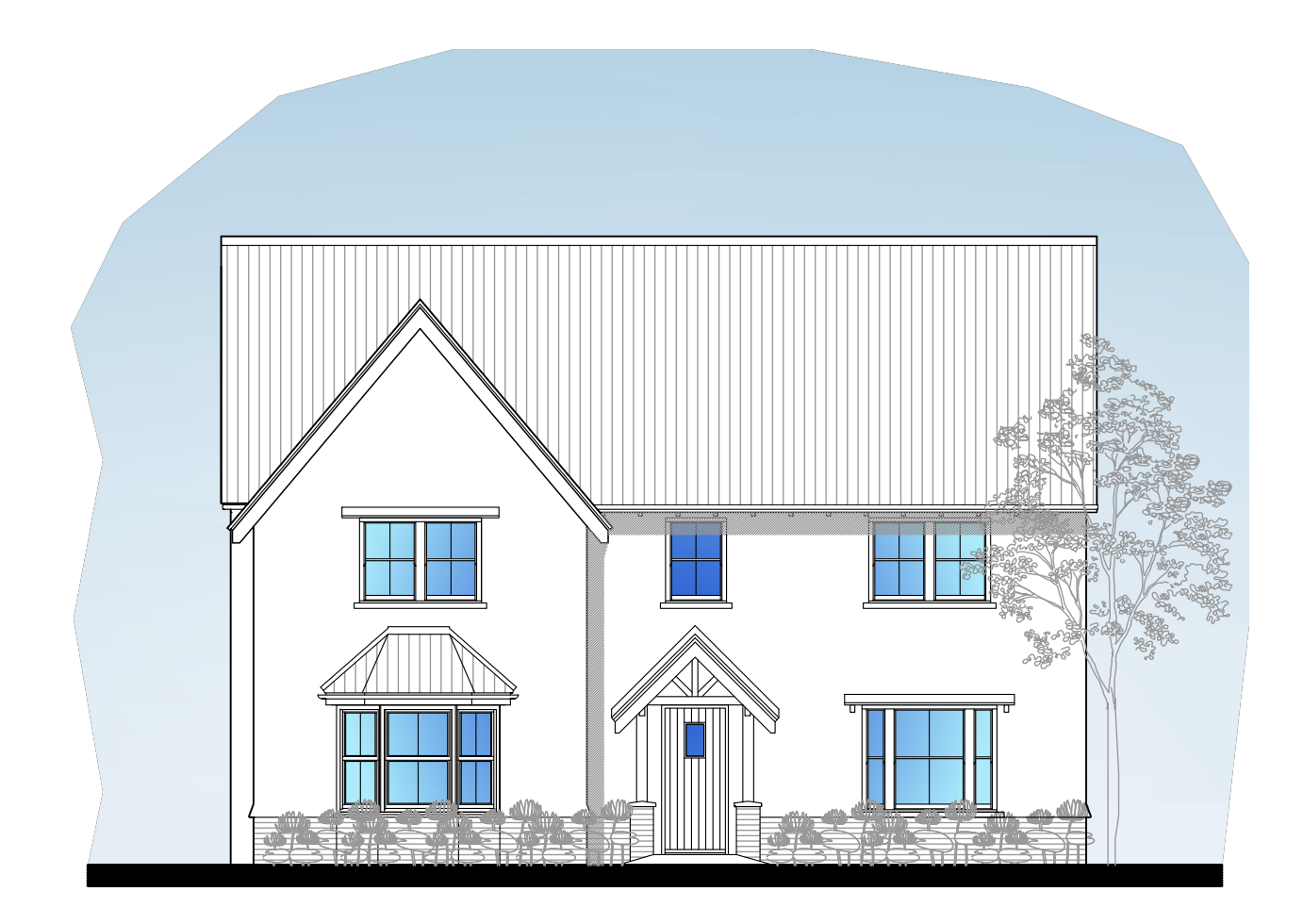
Illustration of Proposed Dwelling (to be agreed at reserves matter stage) Scale 1:100