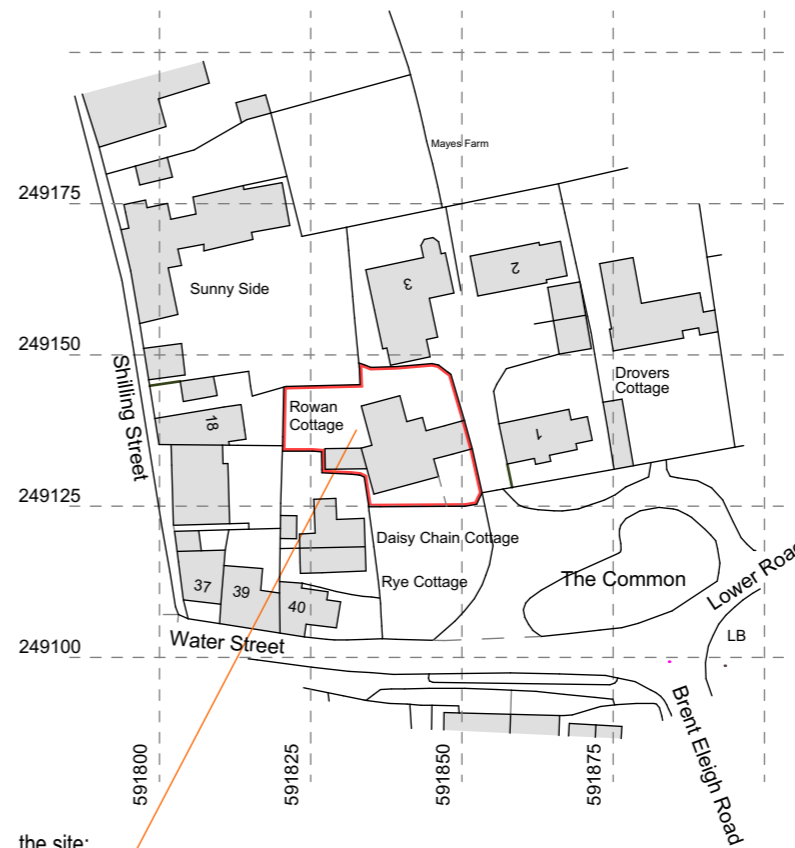
Location plan 1:1250

the site: Rowan Cottage The Common Lavenham SUDBURY CO10 9RL