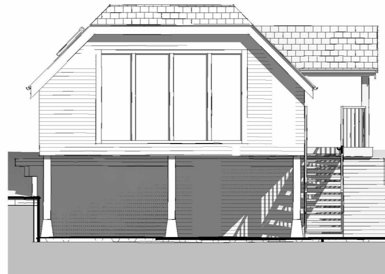
South 1 : 100