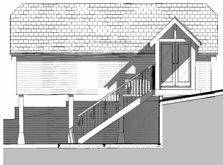
East 1 : 100