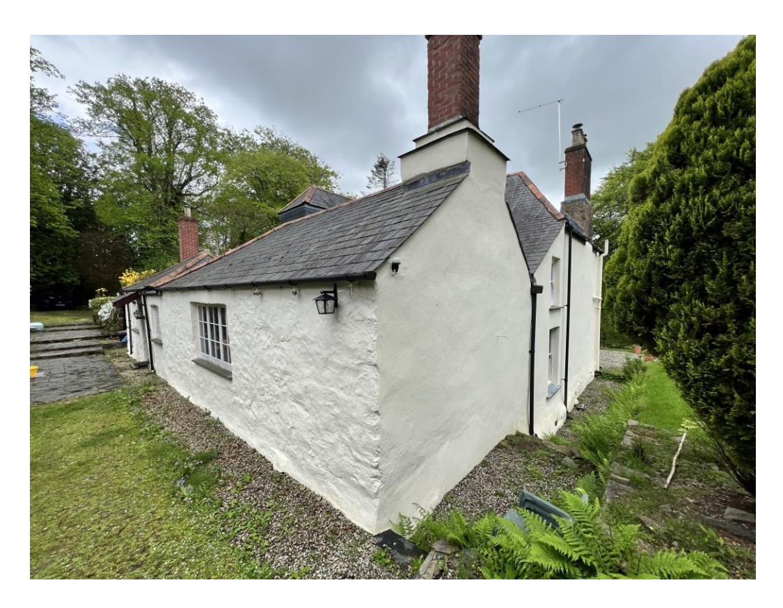
Figure 4 – Photograph showing North elevation.