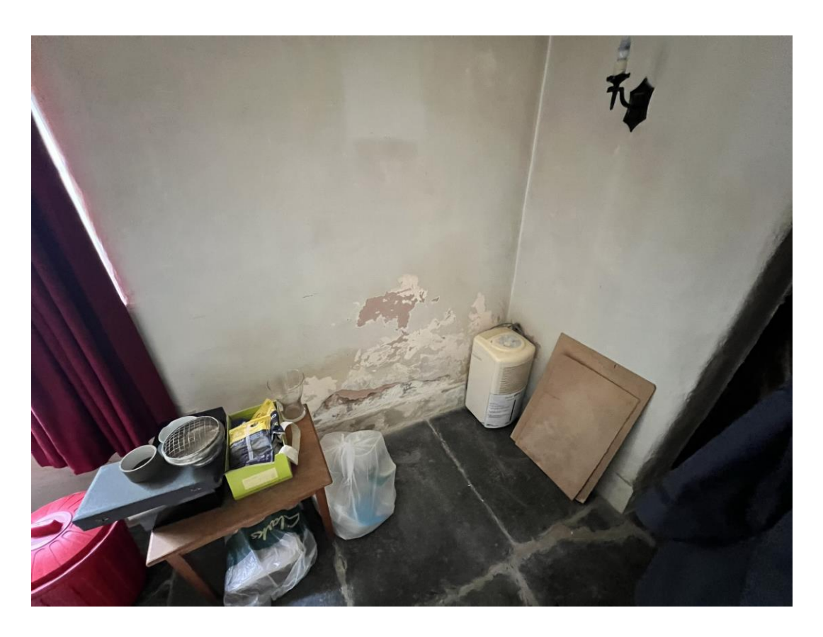
Figure 6 – Photograph showing damp staining and plaster blistering.