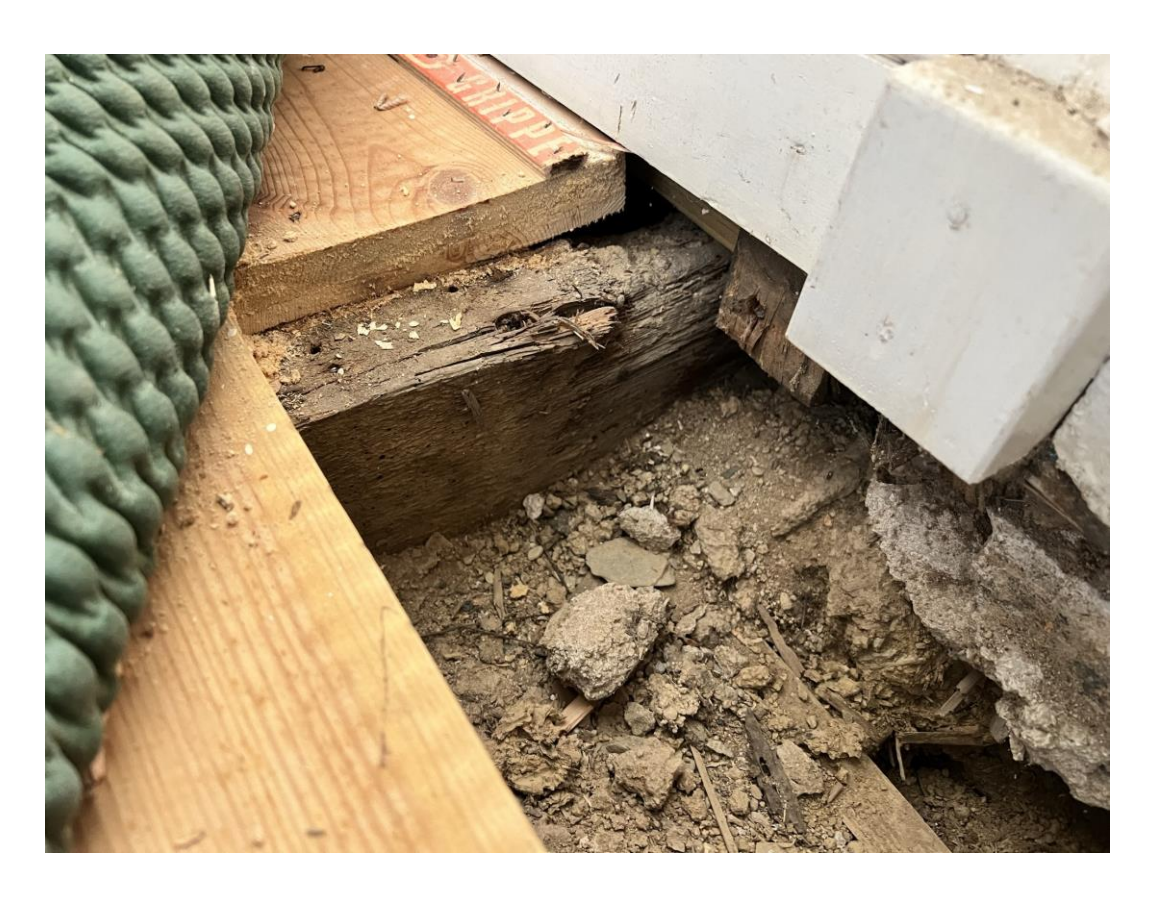
Figure 2 – Photograph showing rotten floor joists to first floor landing.