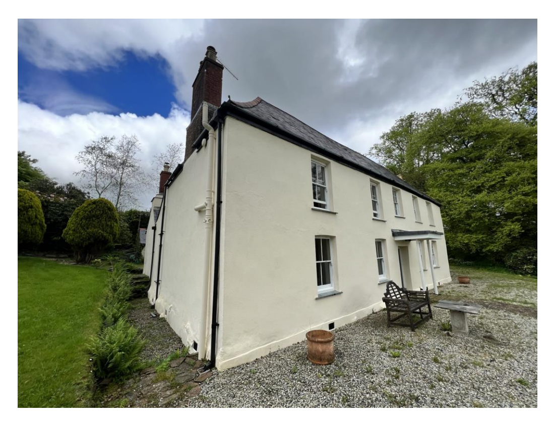
Figure 1 - Photograph showing entrance to Kirland Manor.

CHECKED BY: J A TAYLOR B.Sc (Hons) Assoc RICS