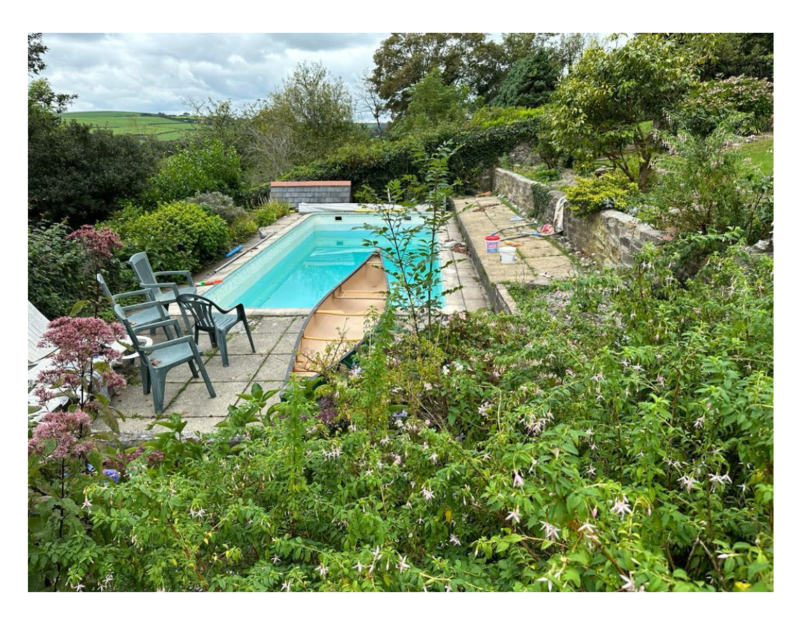
Figure 5 - Photograph showing existing pool.