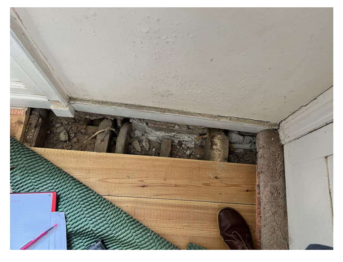
Figure 3 – Photograph showing rotten floor joists to first floor landing.