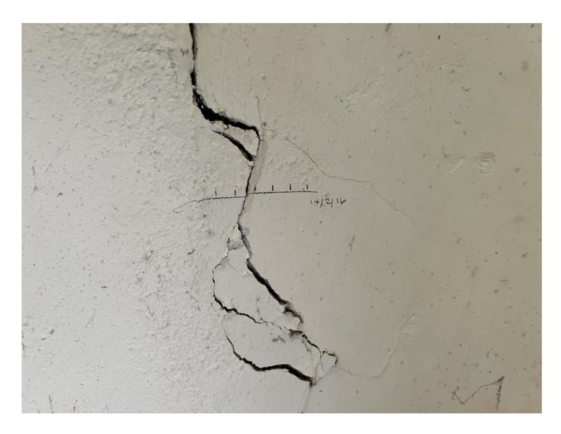
Figure 8 – Photograph showing cracking on first floor landing.