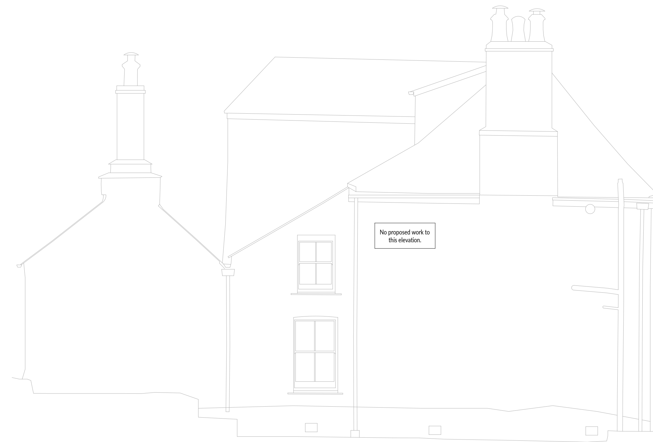
Proposed West Elevation 1:50