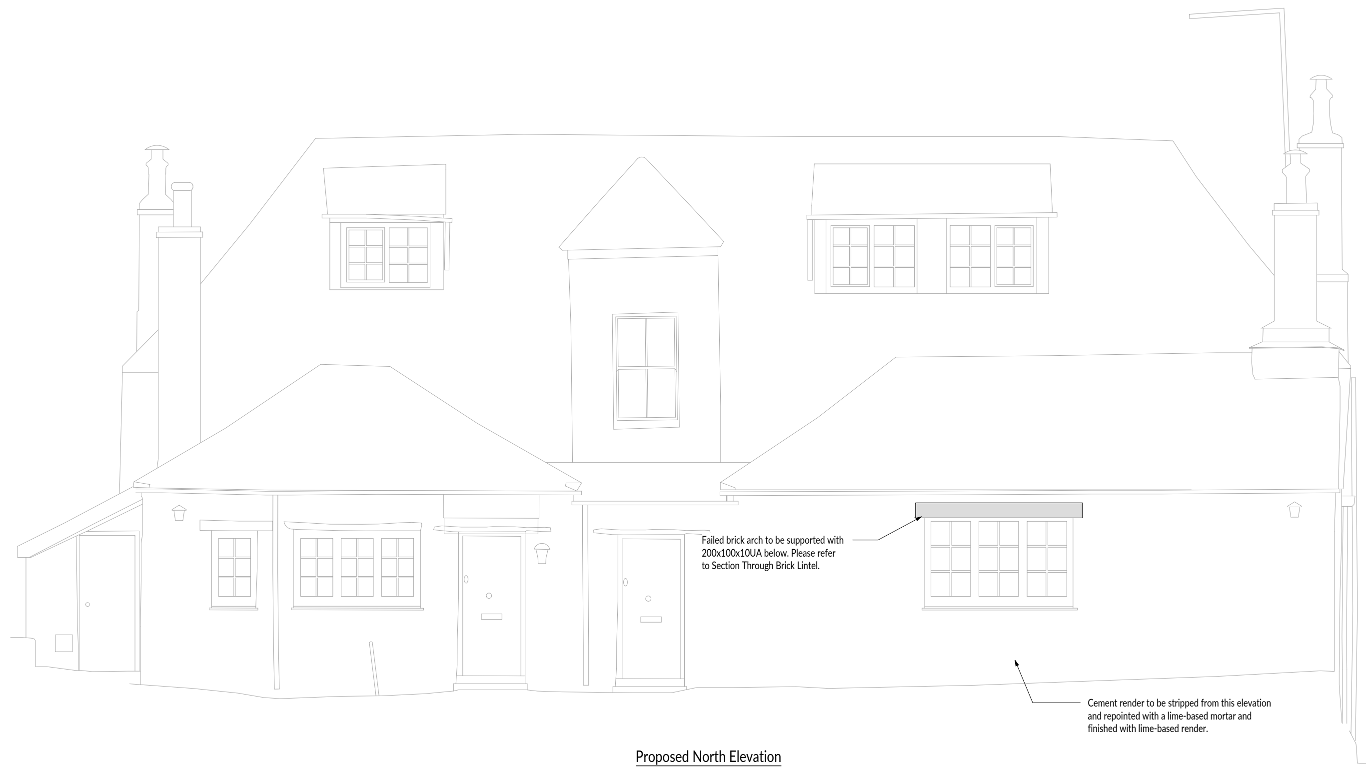
Proposed North Elevation 1:50