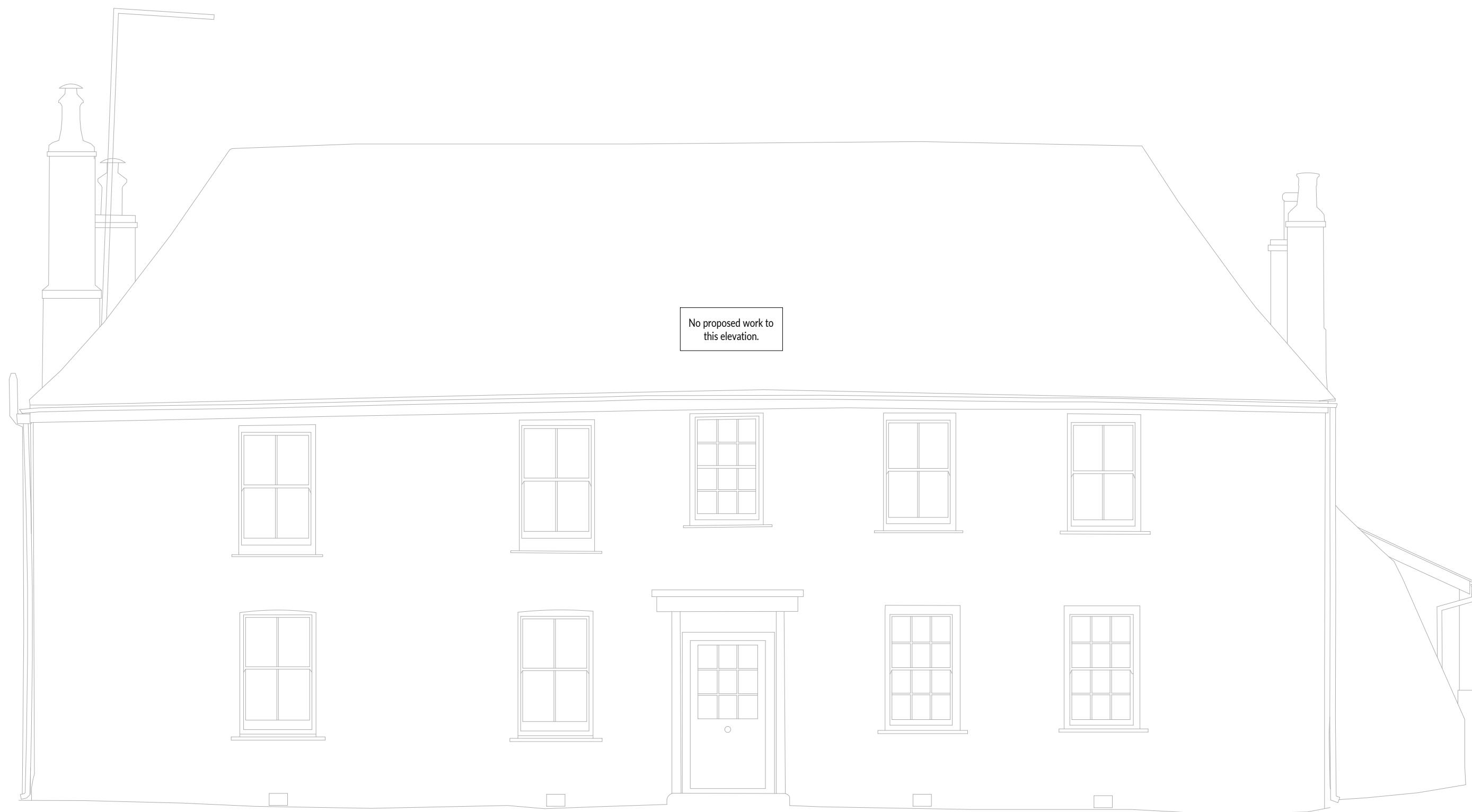
Proposed South Elevation 1:50