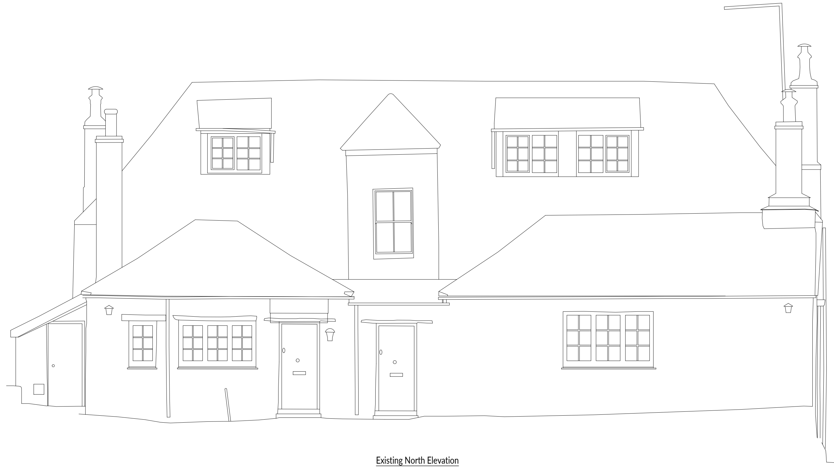
Existing North Elevation 1:50