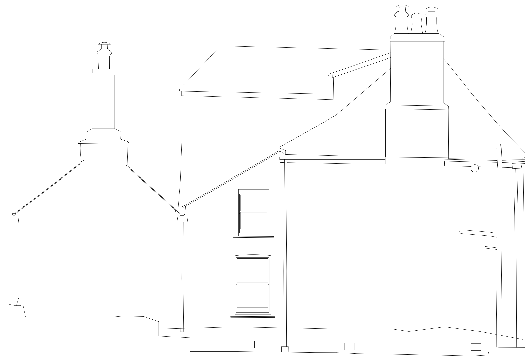
Existing West Elevation 1:50