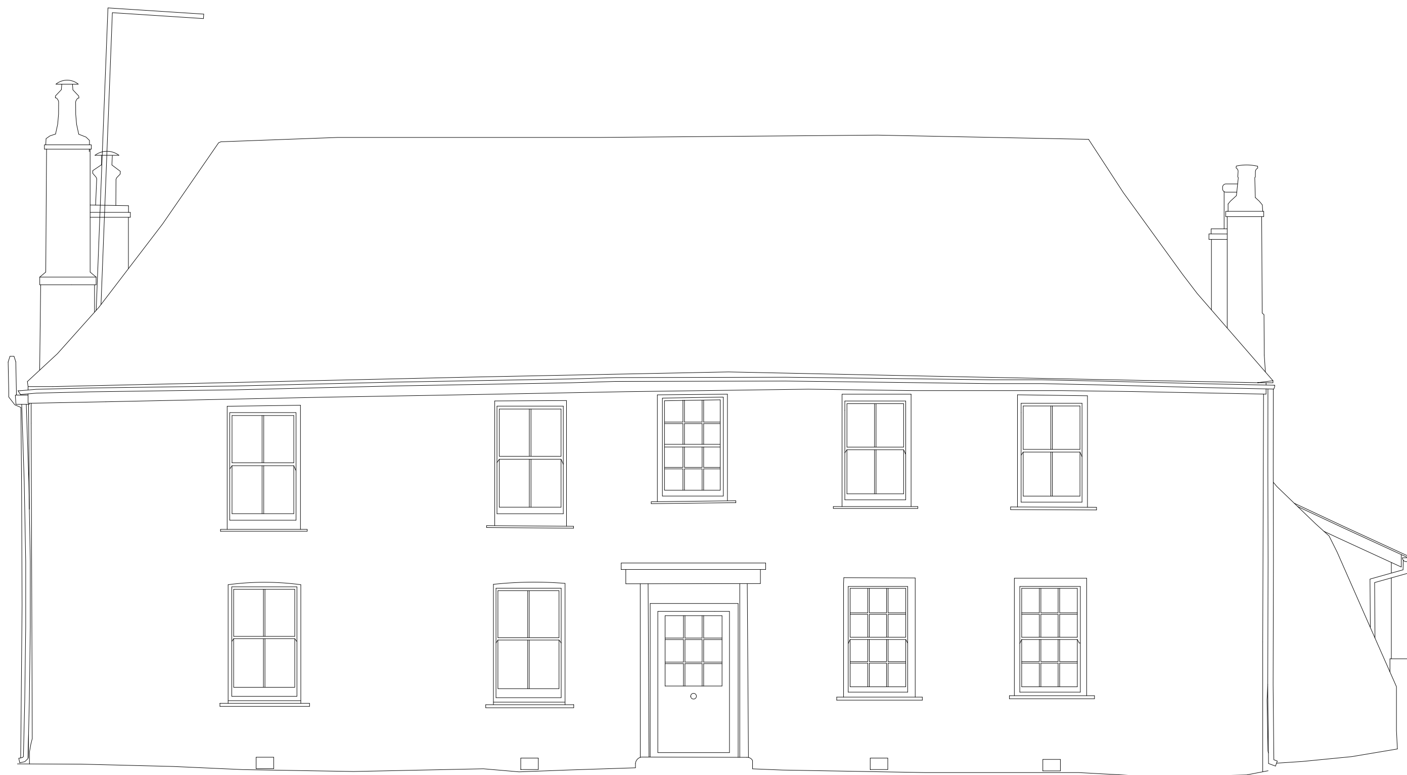
Existing South Elevation 1:50