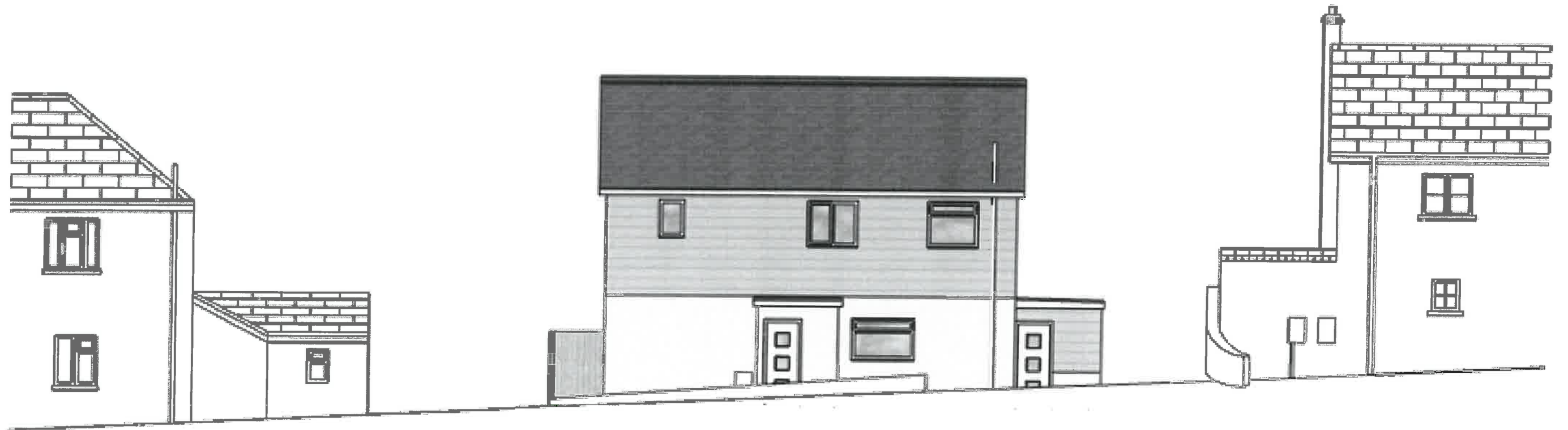
Proposed Street View