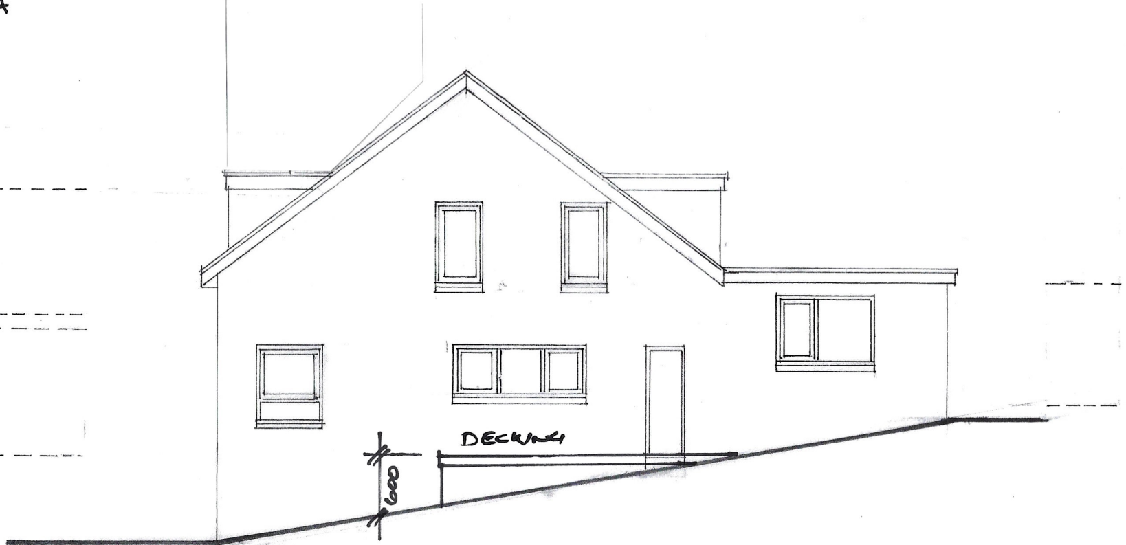
SIDE ELEVATION. 1:100