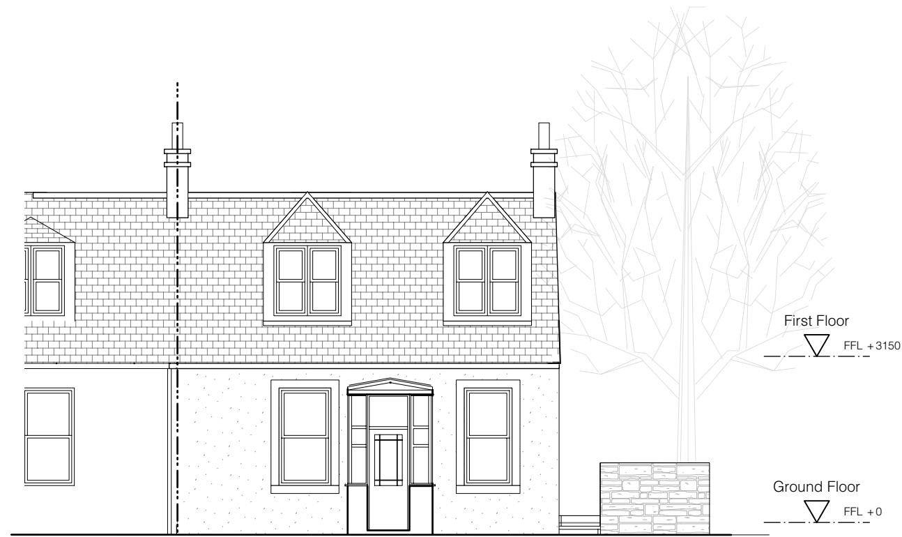
Front Elevation (South) 1:100