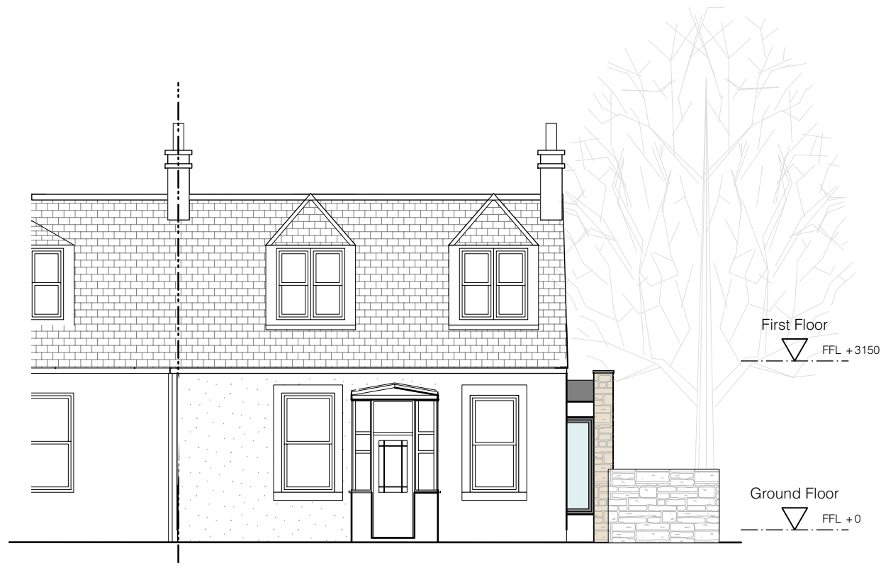
Front Elevation (South) 1:100