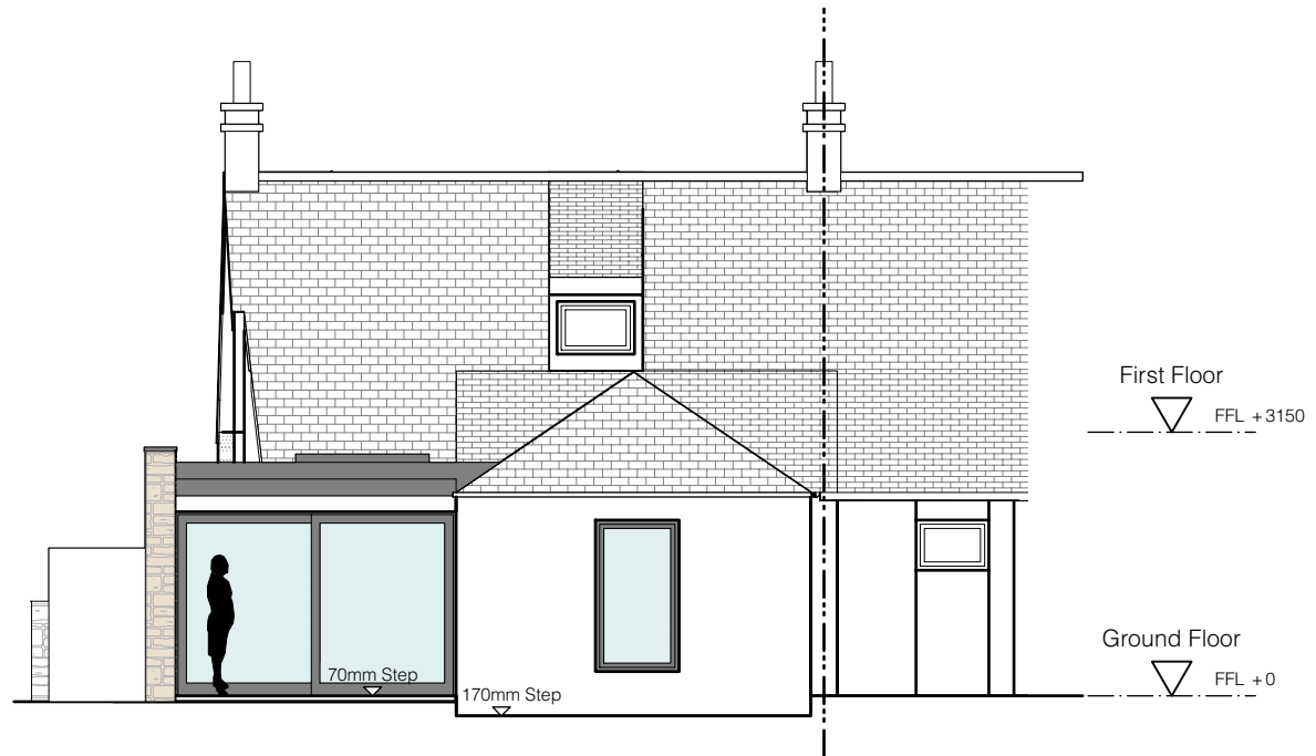
Rear Elevation (North) 1:100