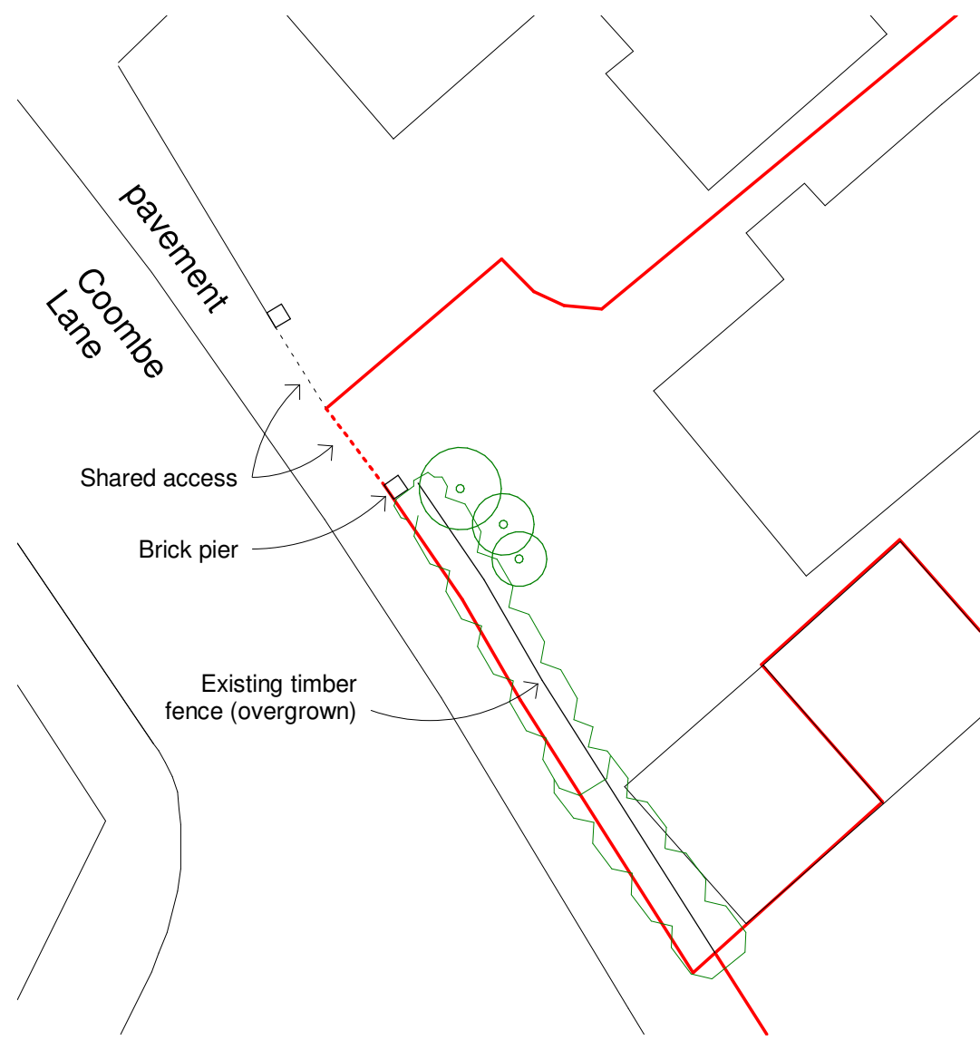
2 Site Plan - Existing 1 : 200