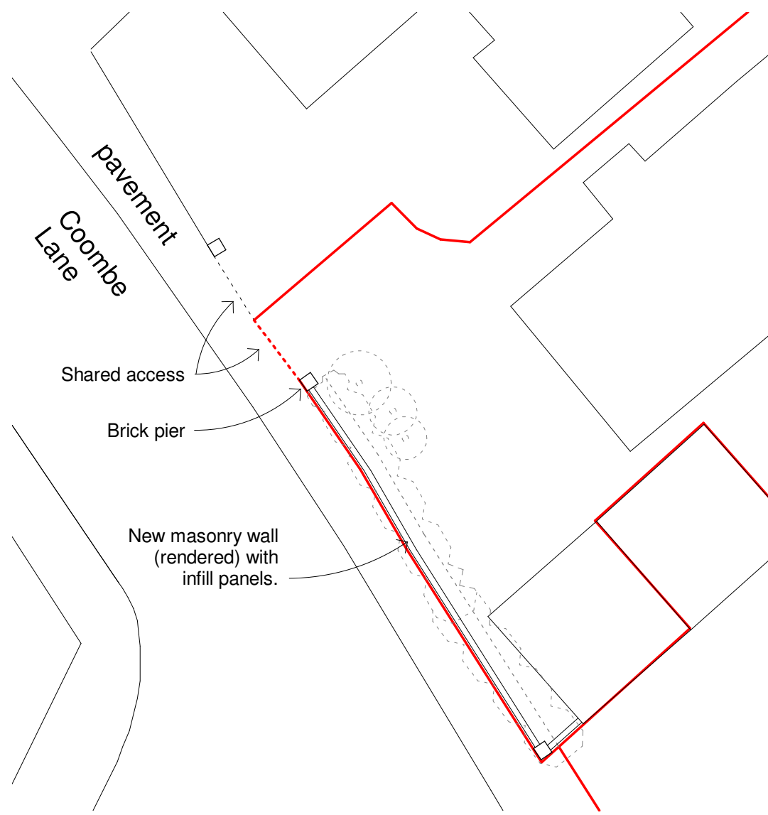
3 Site Plan - Proposed 1 : 200

Andrew Minto Architecture Ltd Trym Lodge 1 Henbury Road Westbury-on-Trym Bristol, BS9 3HQ Web: www.andrewminto.co.uk Email: office@andrewminto.co.uk Tel: 0117 926 9997