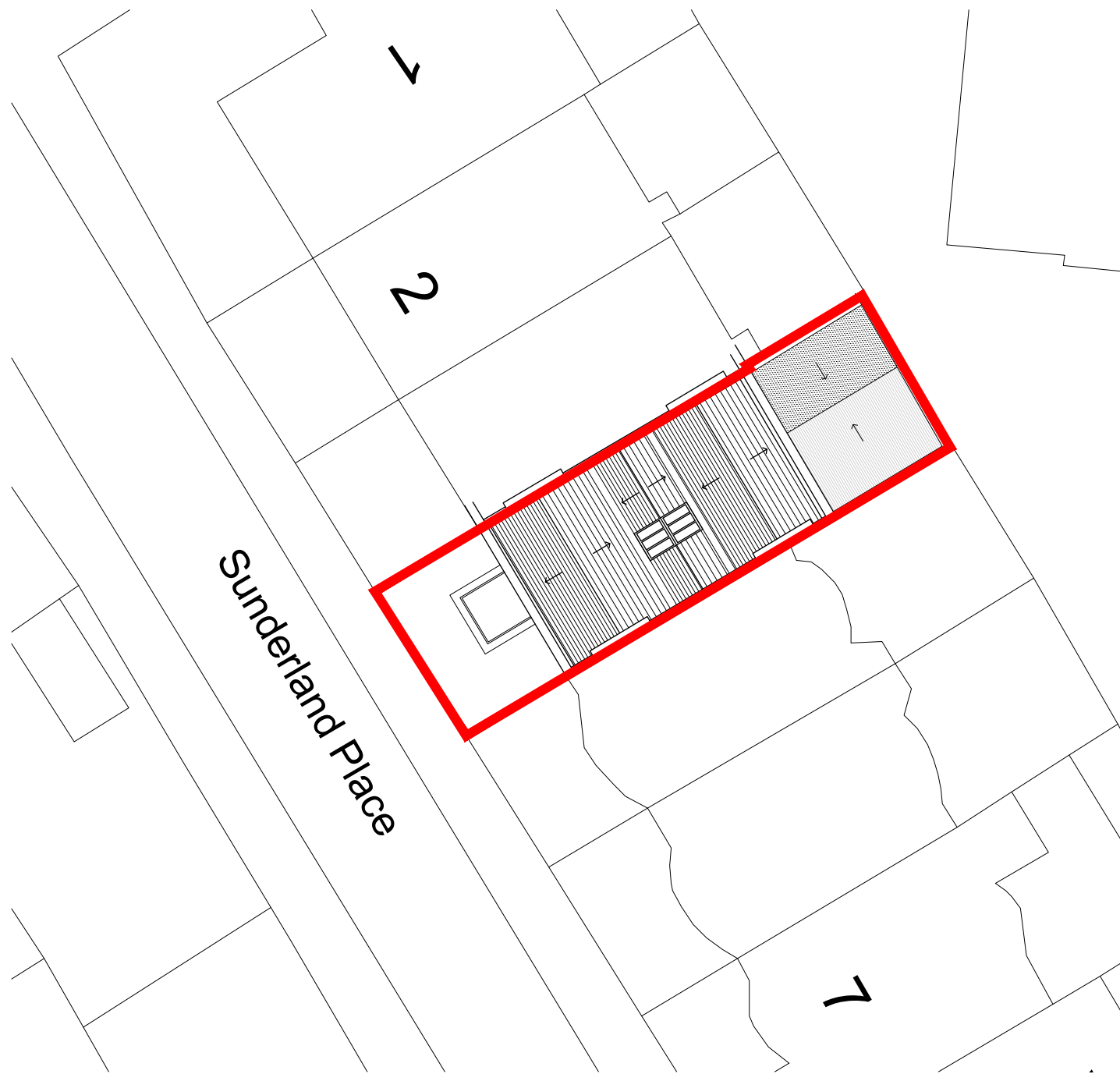
BLOCK PLAN- PREVIOUS ARRANGEMENT 1:200