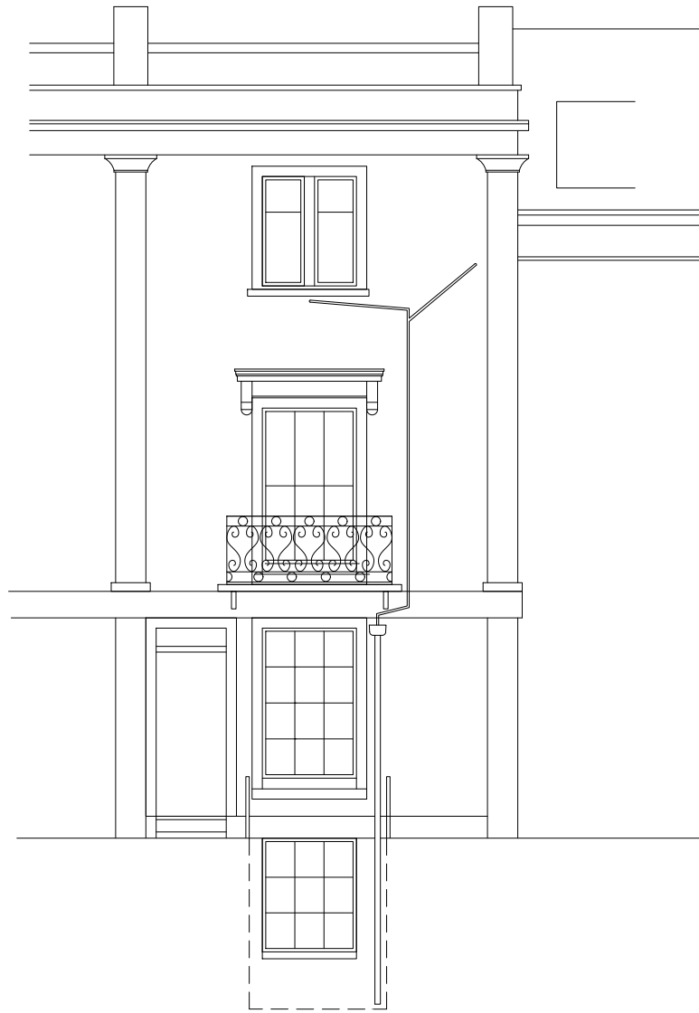
SUNDERLAND PLACE ELEVATION

PROPOSAL SUBJECT TO: SITE SURVEY; STATUTORY APPROVALS; DESIGN DEVELOPMENT.