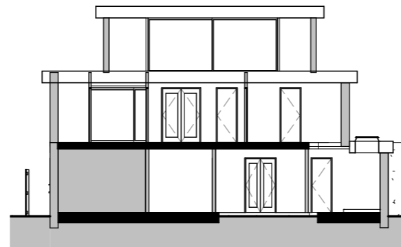
2 East West Site Section 1 : 200