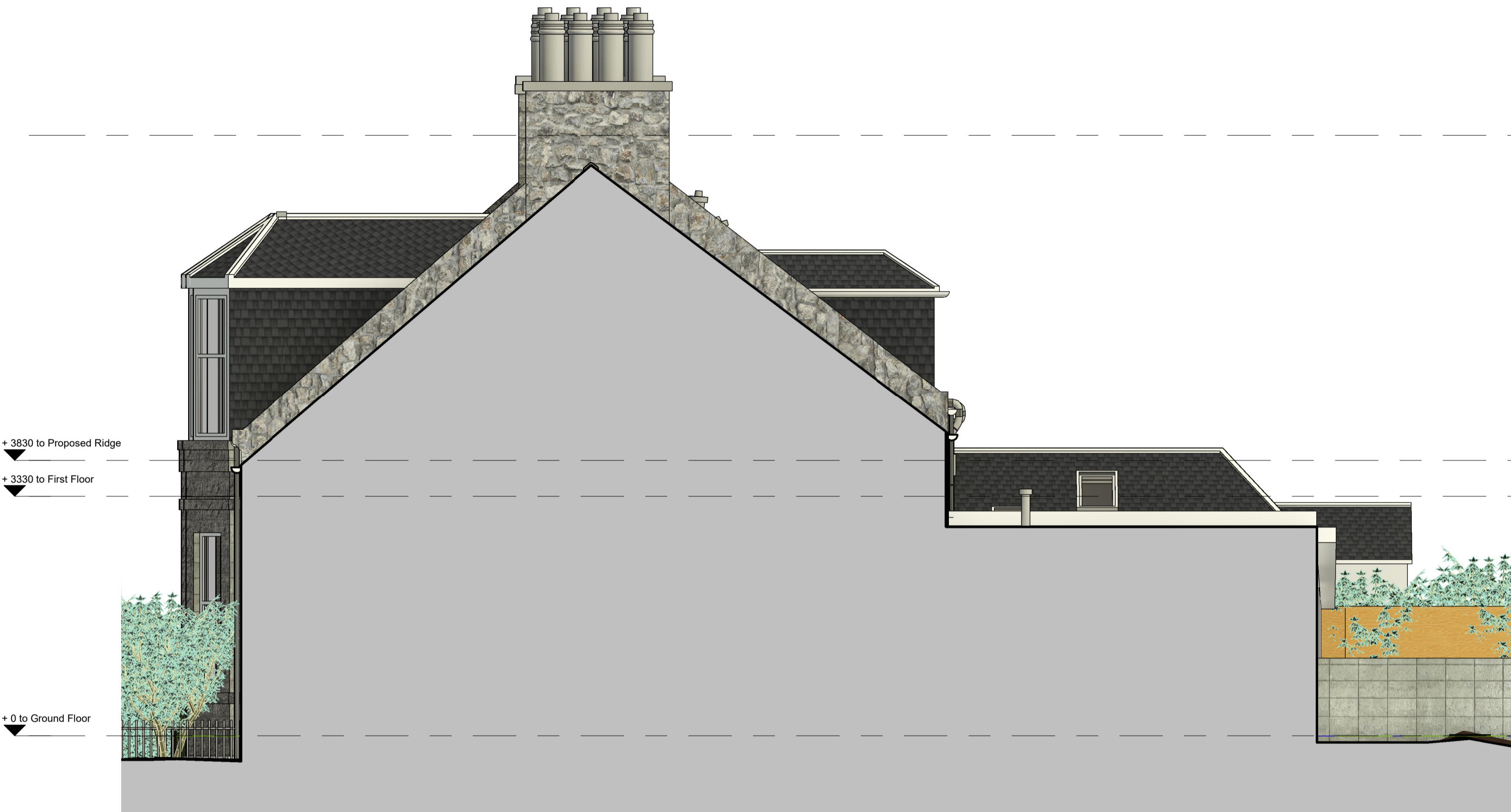
Existing South Elevation 1 : 50