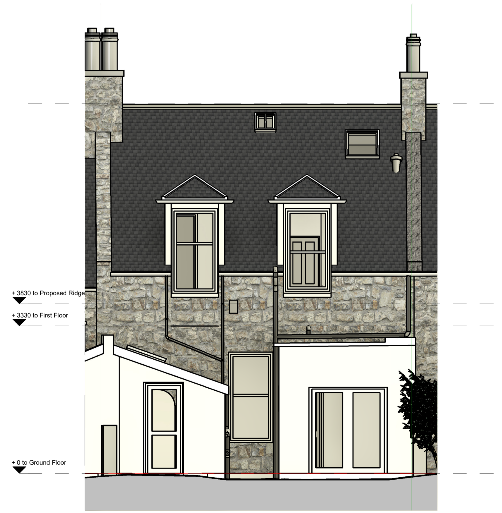
Existing East Elevation 1 : 50