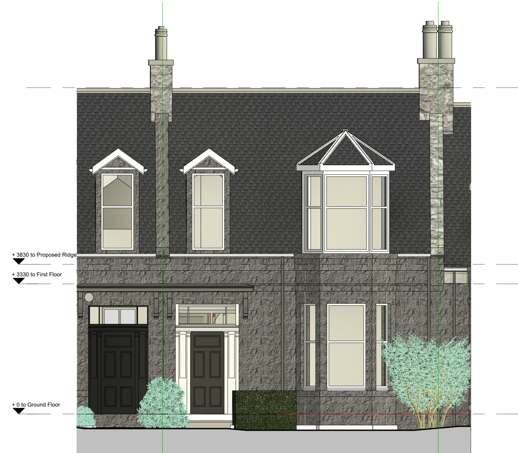
Existing West Elevation 1 : 50