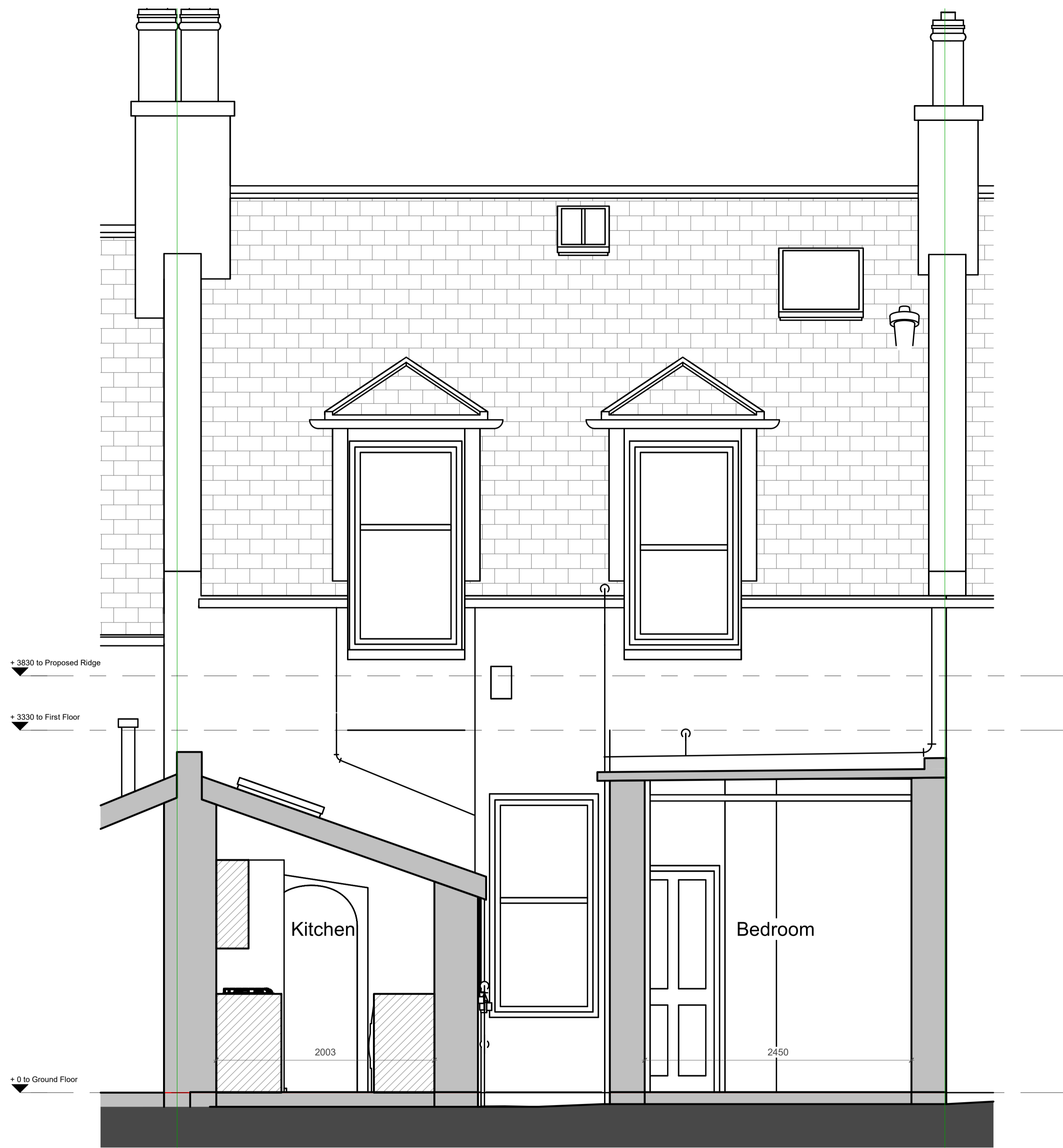
Existing Section 1 1 : 25