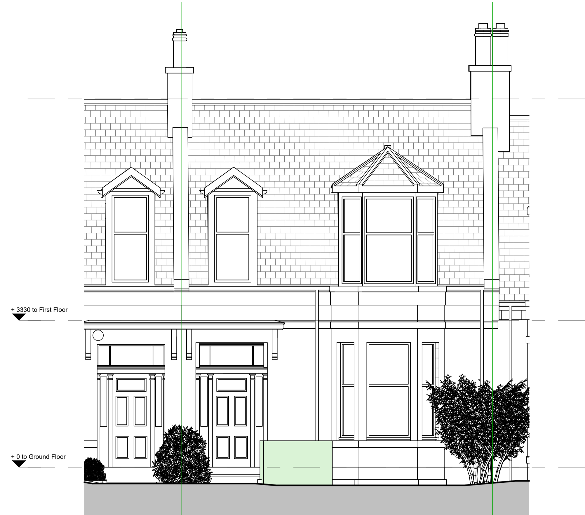
Proposed West Elevation 1 : 50