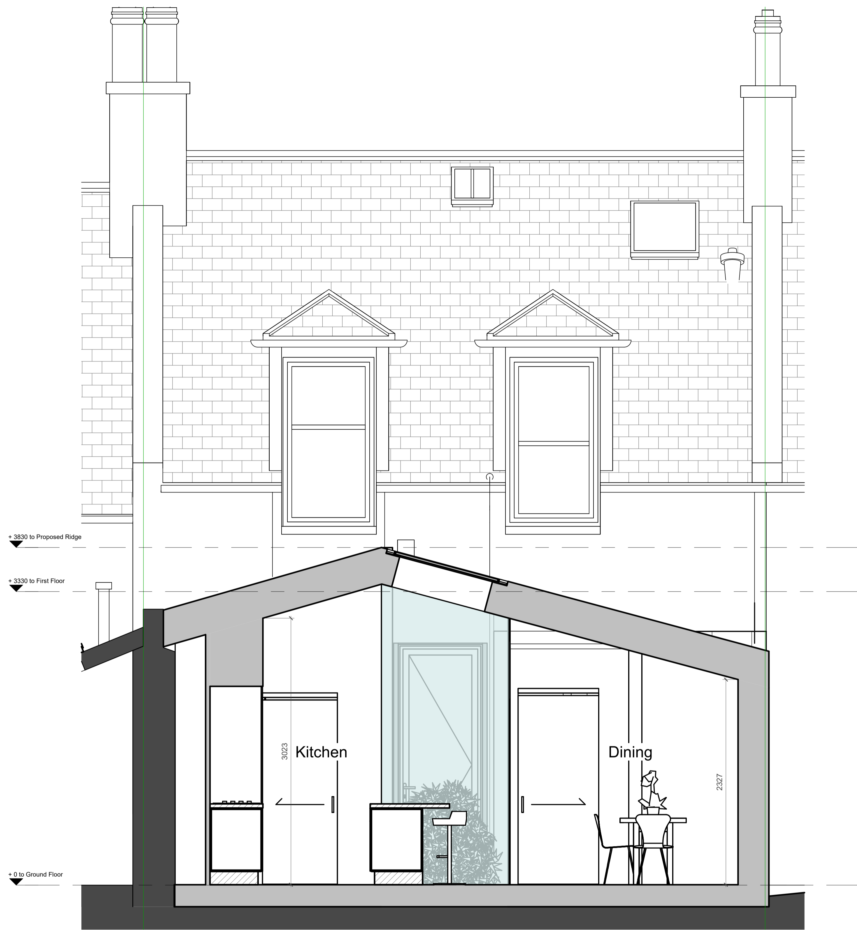
Proposed Section 1 1 : 25