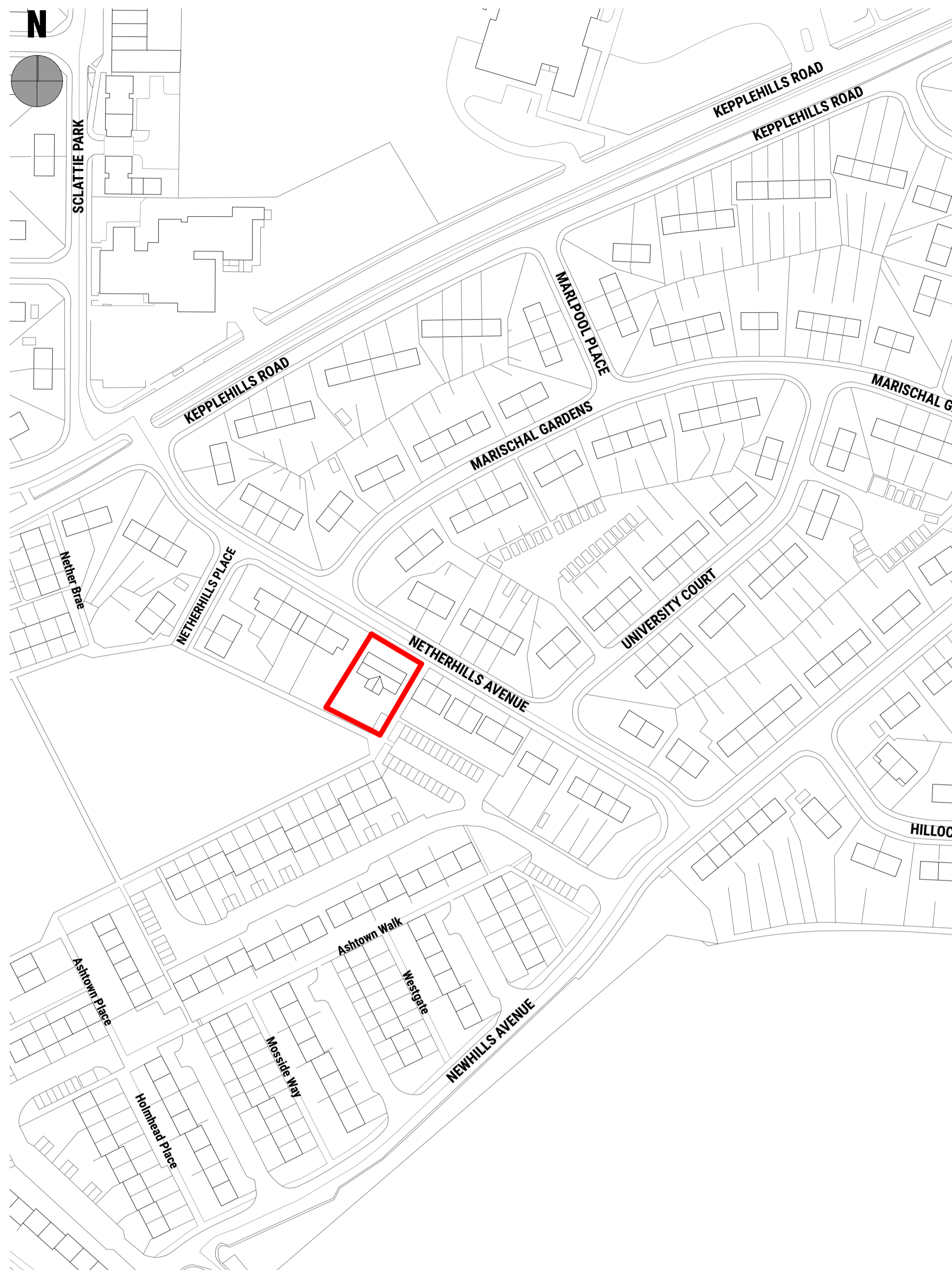
26 NETHERHILLS AVENUE LOCATION PLAN SCALE 1:1250