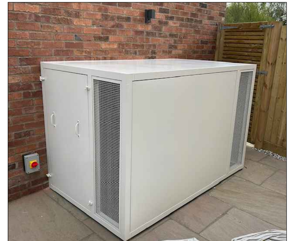
Photo of Acoustic Enclosure