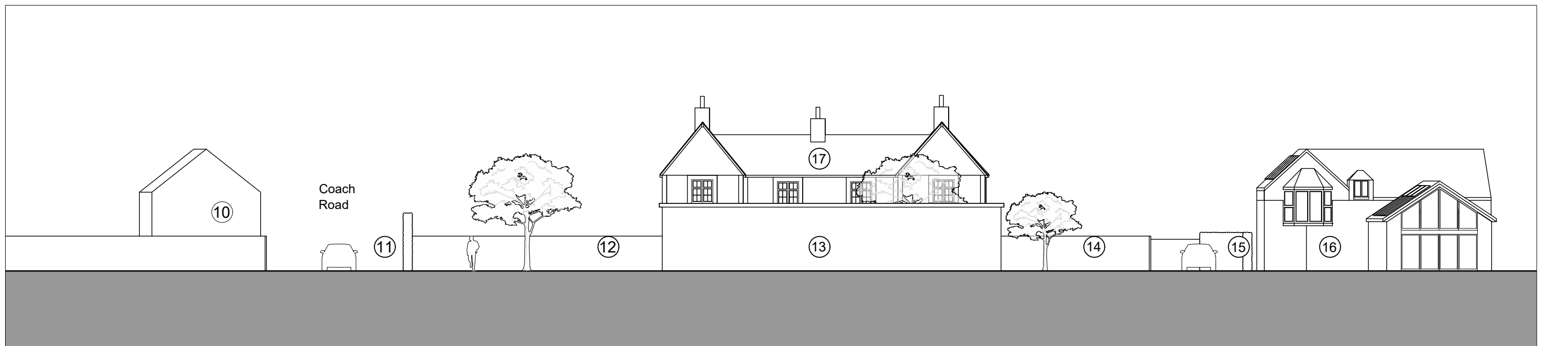
Site Section BB