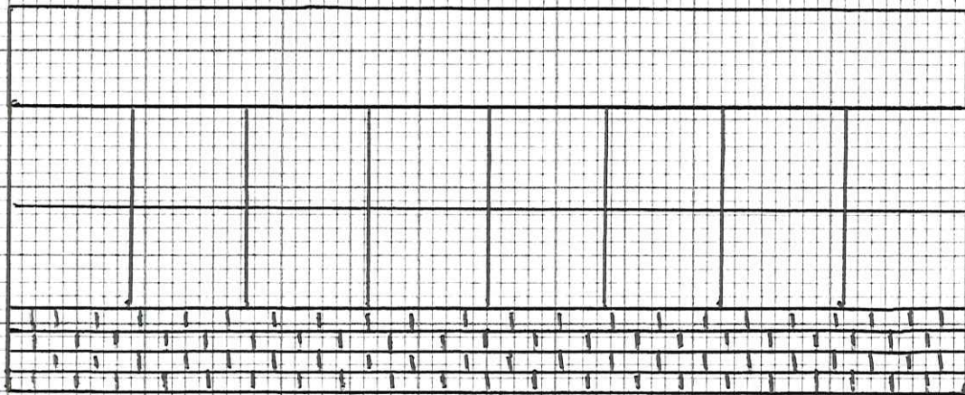
FRONT ELEVATION FACES EAST/WEST