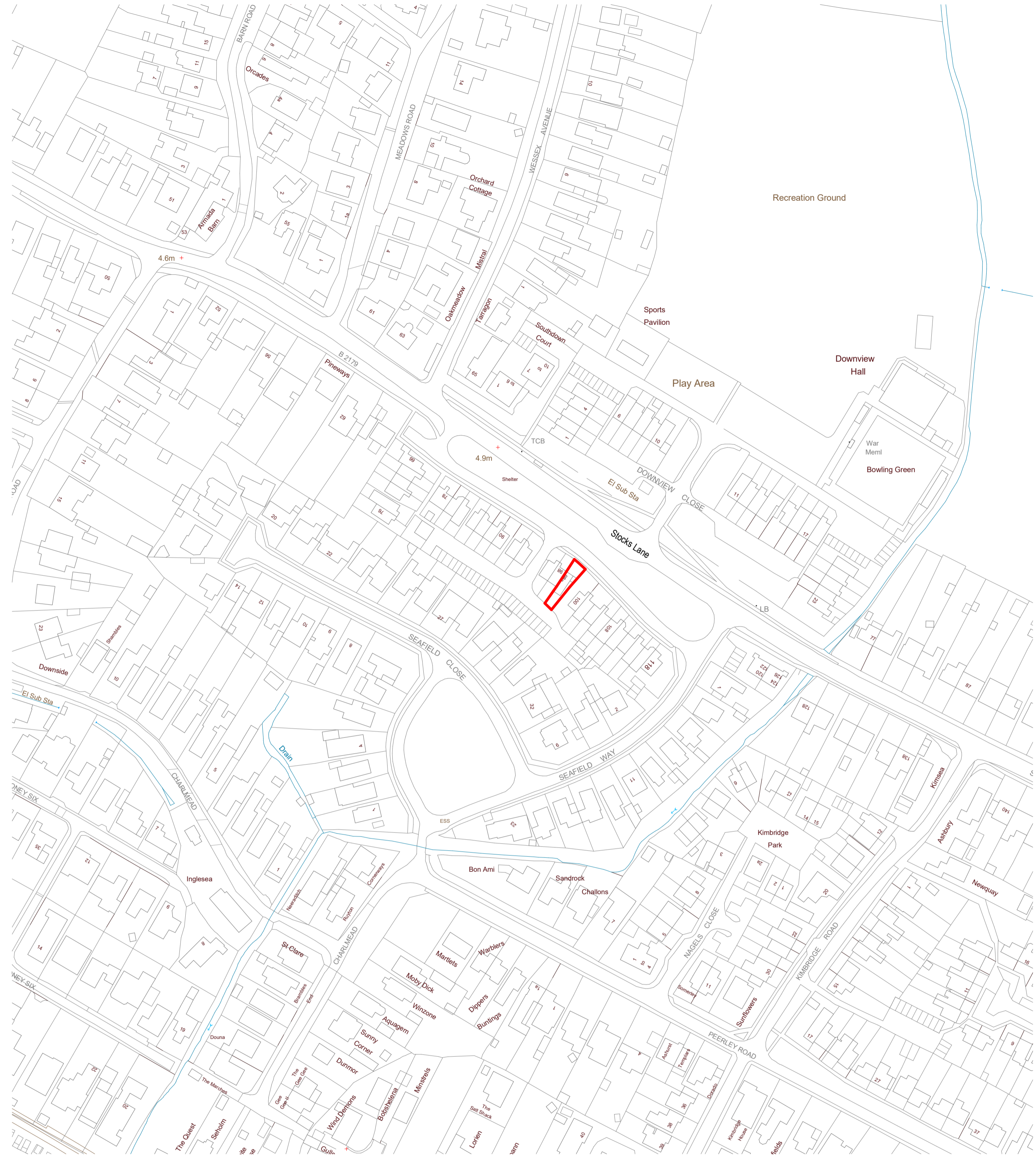
1 APLN - Site Location Plan 1:1250