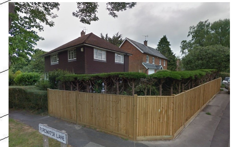
EXISTING VIEW FROM SOUTH EAST