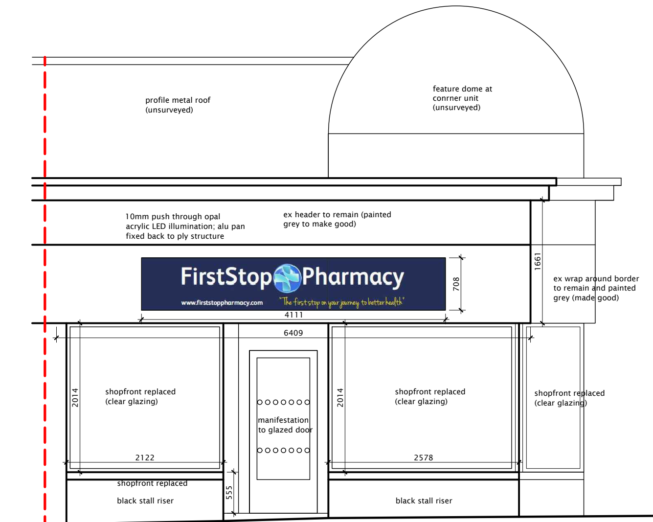
SHOPFRONT ELEVATION AS PROPOSED Scale 1:50