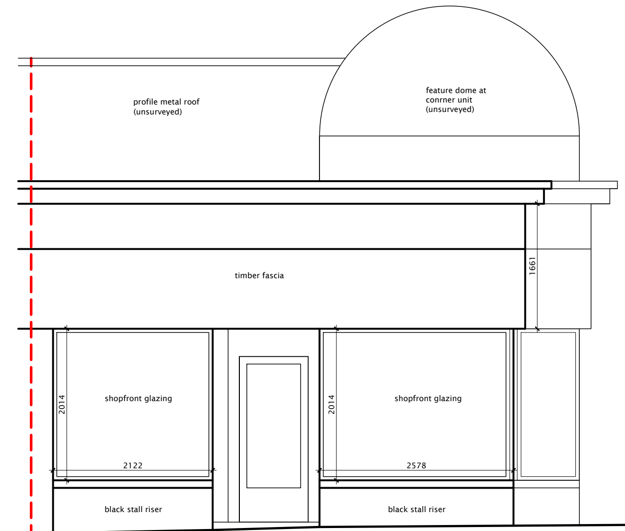
SHOPFRONT ELEVATION AS EXISTING Scale 1:50

notes: This drawing is for Building Warrant Purposes ONLY. Further Architectural or Engineering details may be required for construction and site works. This drawing to be read together with all other drawings and specifications. Any discrepancies to be reported immediately to the Architect. Only CONSTRUCTION or CONTRACT status drawings to be used for construction purposes. This drawing and its design are copyright property of HAB ARCHITECTURE LIMITED and is not to be reproduced without the permission of same. These drawings are to be read strictly in accordance with the Structural Engineer's drawings and specifications. DO NOT SCALE FROM THESE DRAWINGS. If in doubt ASK! Refer your query back to the Architect or appropriate member of the design team.