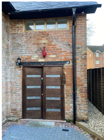
Front Elevation View