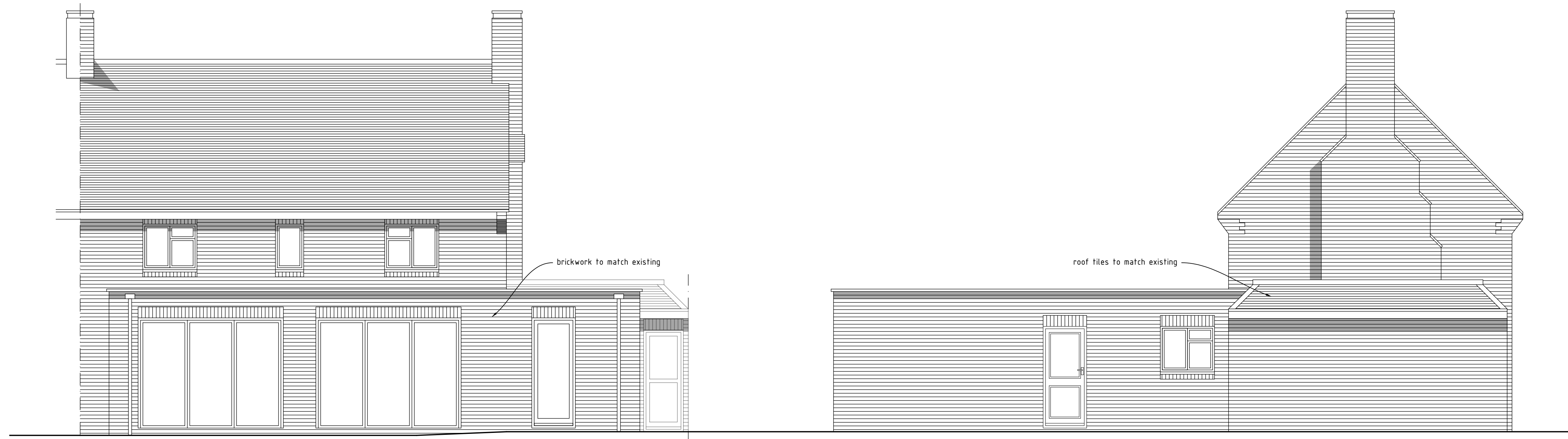
REAR ELEVATION (south west facing)