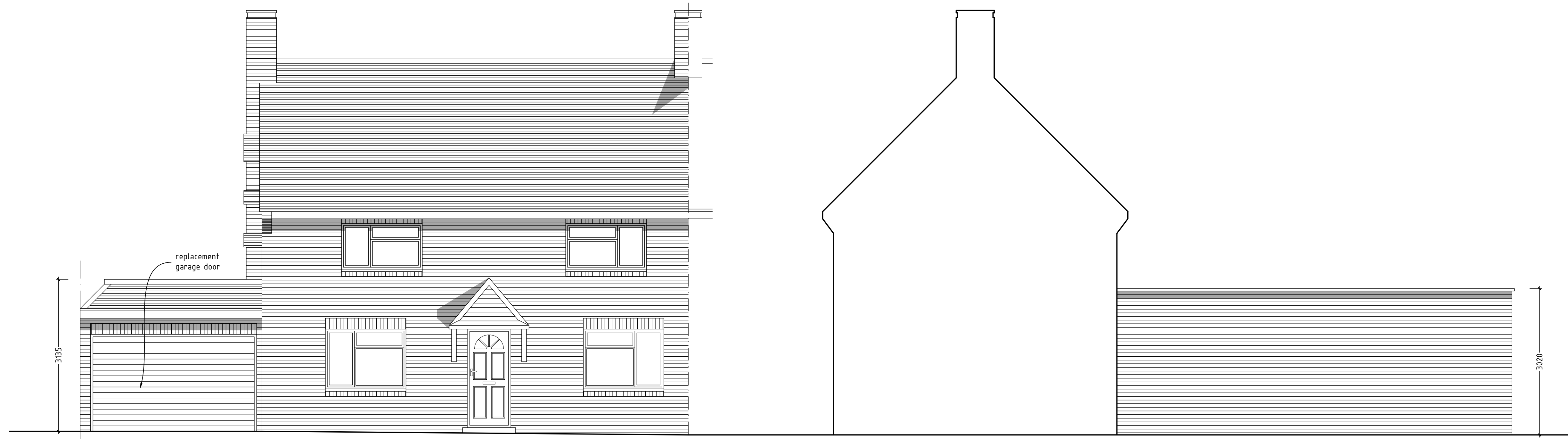
FRONT ELEVATION (north east facing)