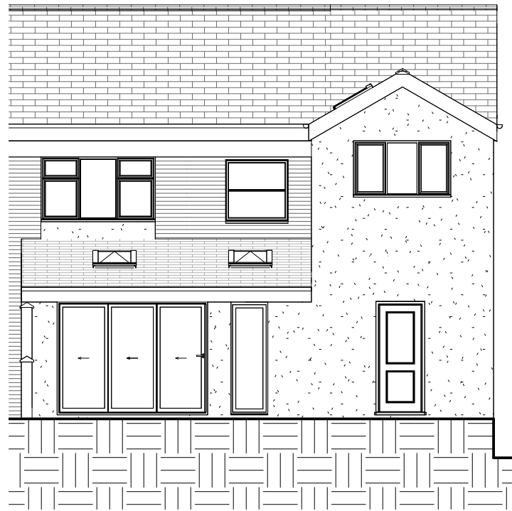
Proposed South East Elevation