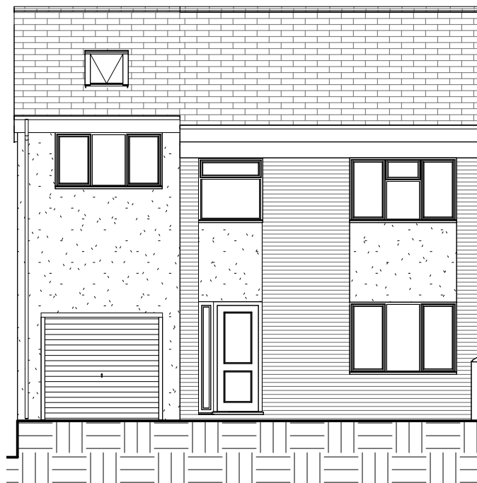
Proposed North West Elevation