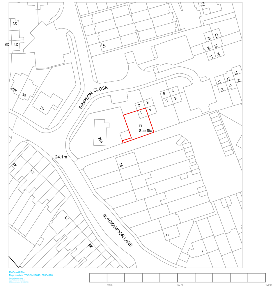
LOCATION PLAN 1.1250

NOTES: All dimensions are in metric. It is advice not to scale off the drawing but to seek the Consultant's advice.