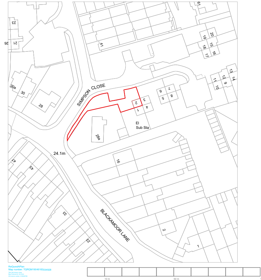
LOCATION PLAN 1.1250