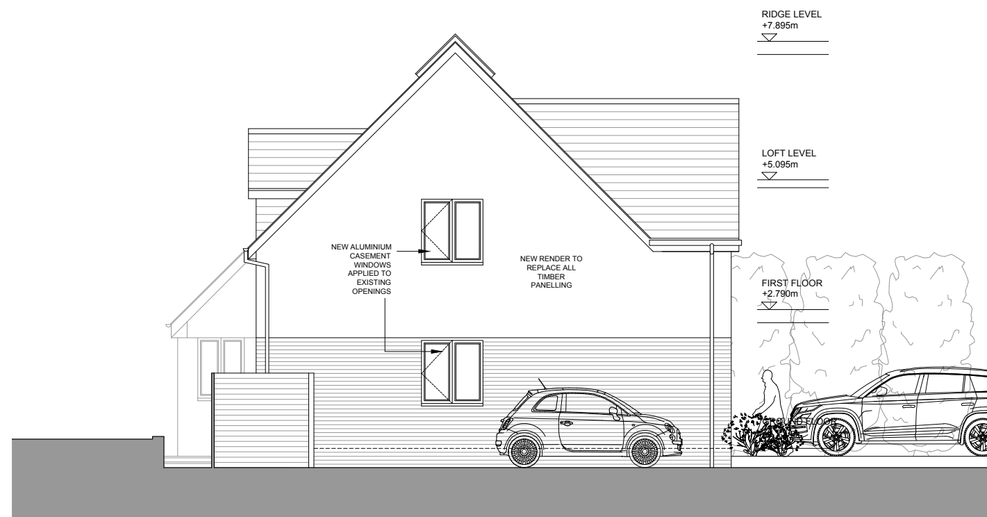
PROPOSED NORTHERN SIDE ELEVATION SCALE 1:100