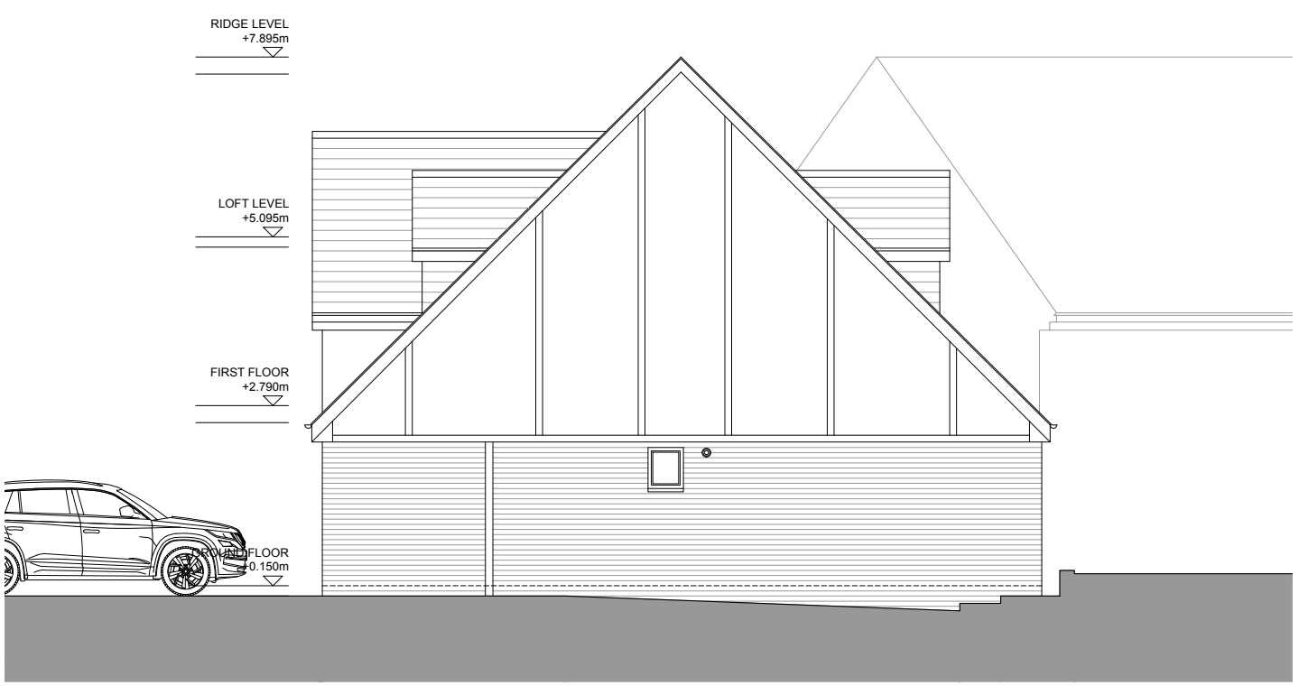
EXISTING SOUTHERN SIDE ELEVATION SCALE 1:100