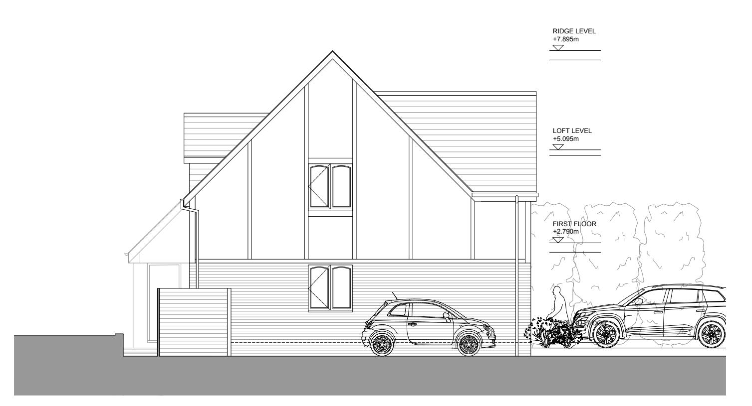
EXISTING NORTHERN SIDE ELEVATION SCALE 1:100

THIS DRAWING IS COPYRIGHT and must not be traced or copied in any way, in part or whole by any means whatsoever without prior written consent and may only be used by the present owner, being our current client in relation to the property as referred to on the drawing. This drawing may be copied by an authorised officer of the Local Authority with the sole purpose to assist in the determination of Planning or Building Regulations application and may not be used for any other purpose unless otherwise agreed in writing.