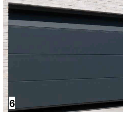
Schedule of Proposed Materials