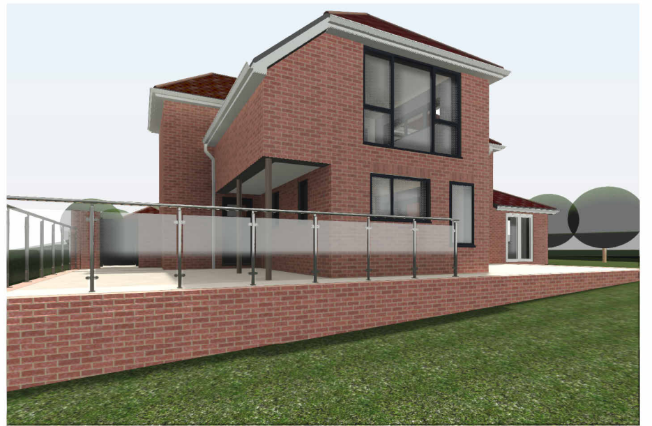
4 Proposed View 4 - rear 2