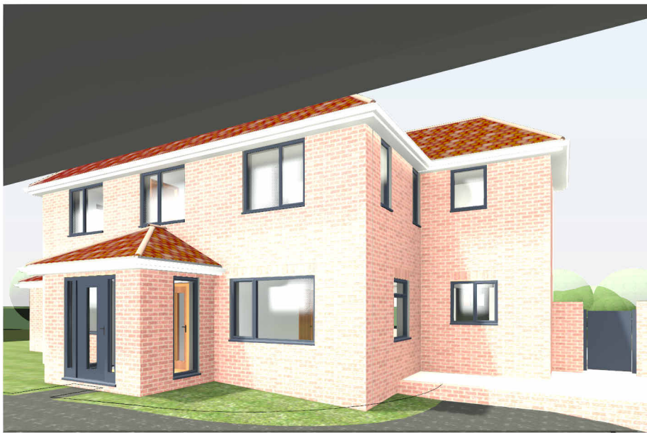
3 Proposed View 3 - front 2