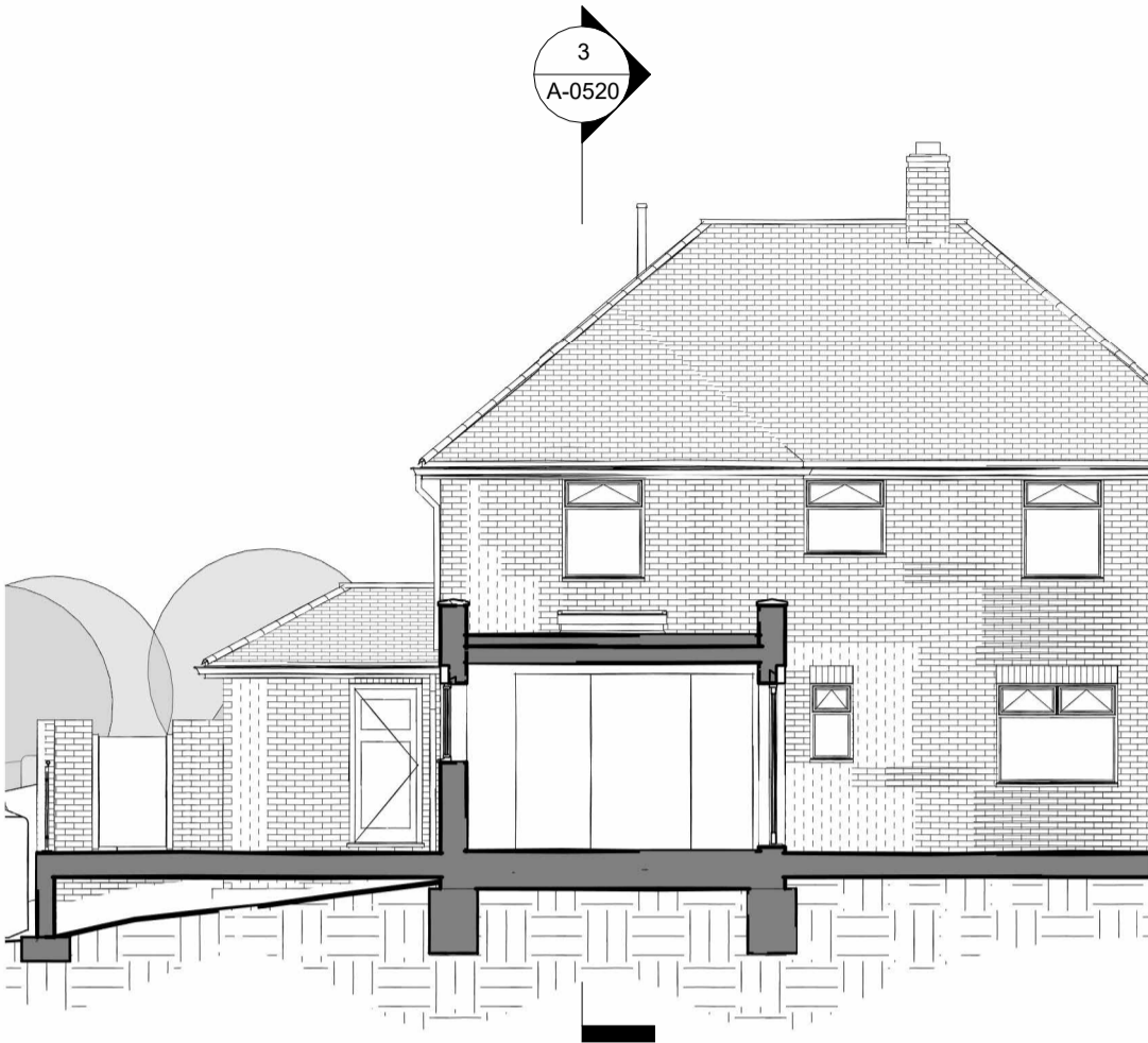
1 Section 1 1 : 100