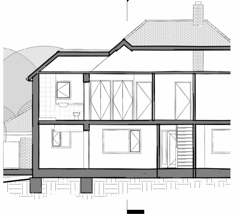
2 Proposed Section 2 1 : 100