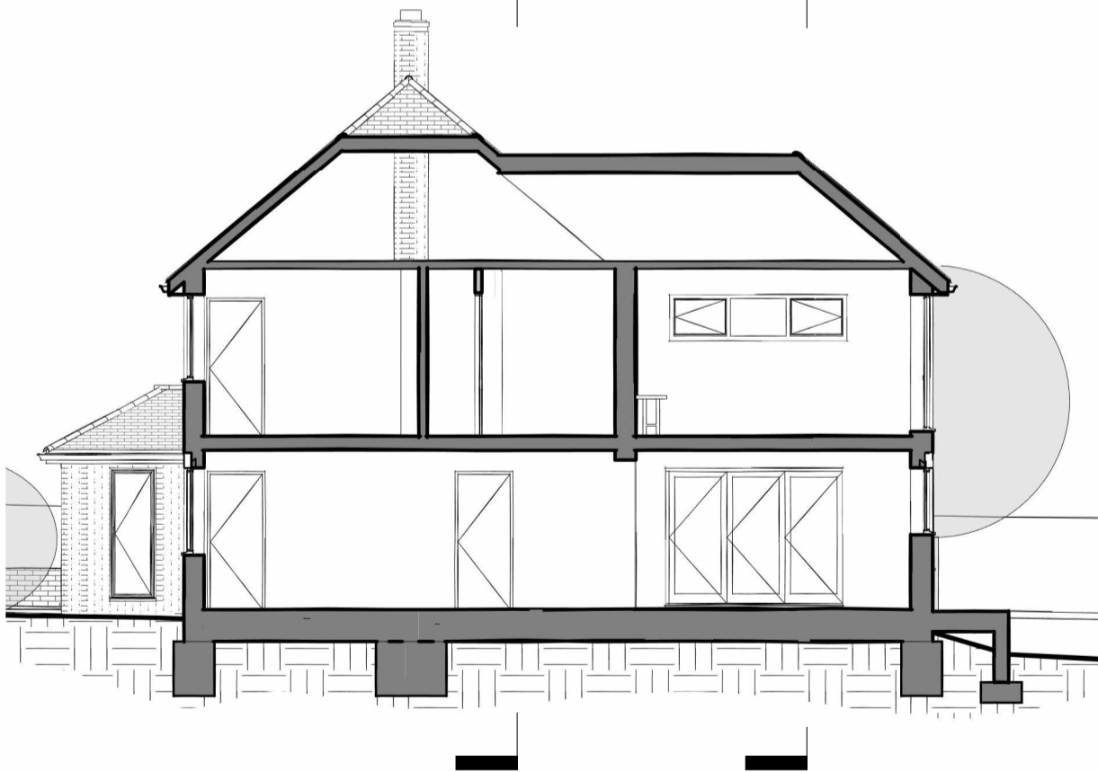
3 Proposed Section 3 1 : 100