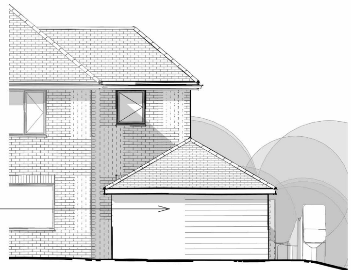
③ Carport elevation rear 1 : 100

Oak framed carport with plain tiling to match house.