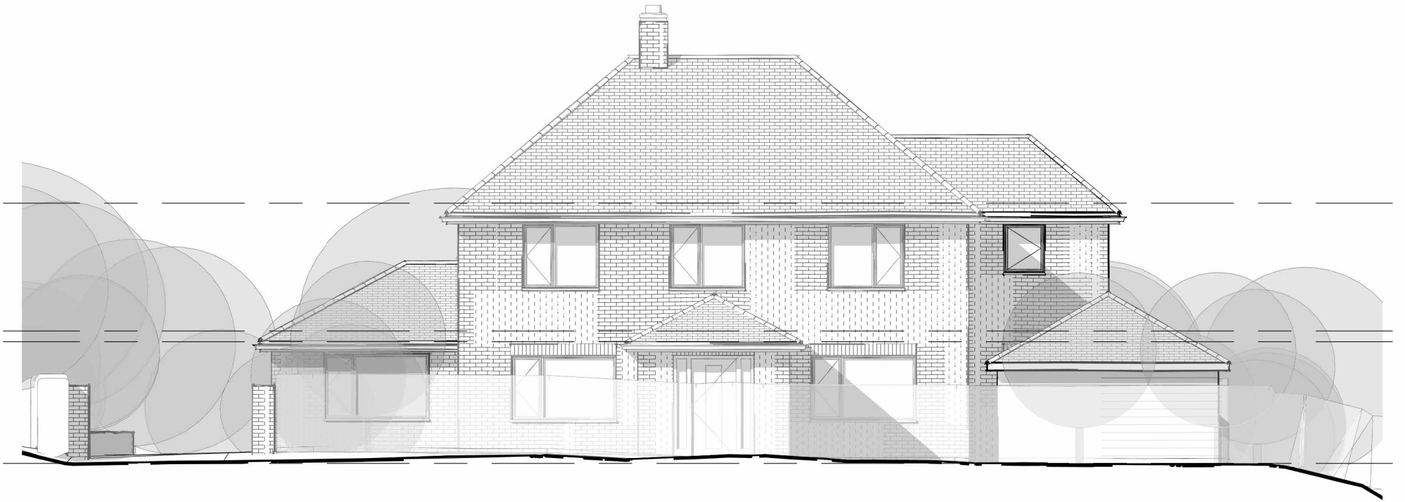
① Street elevation 1 : 100