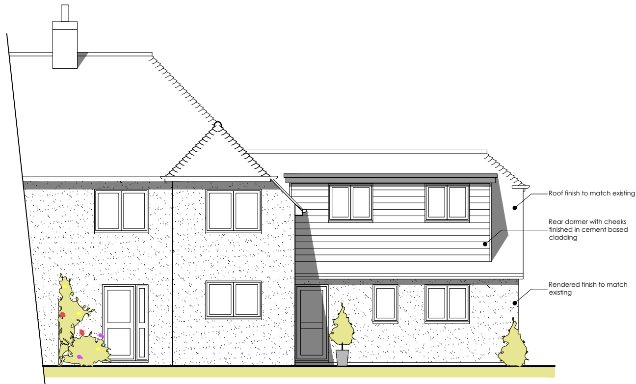
rear - east