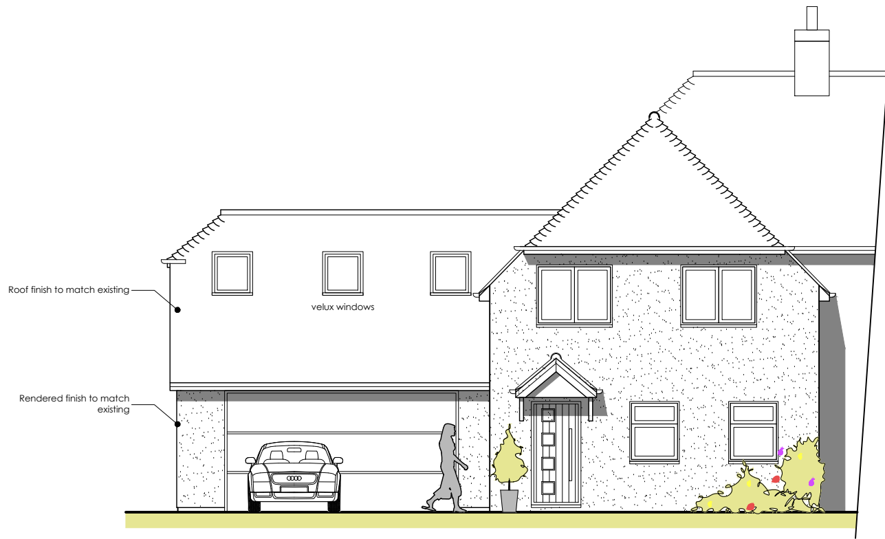
front - west