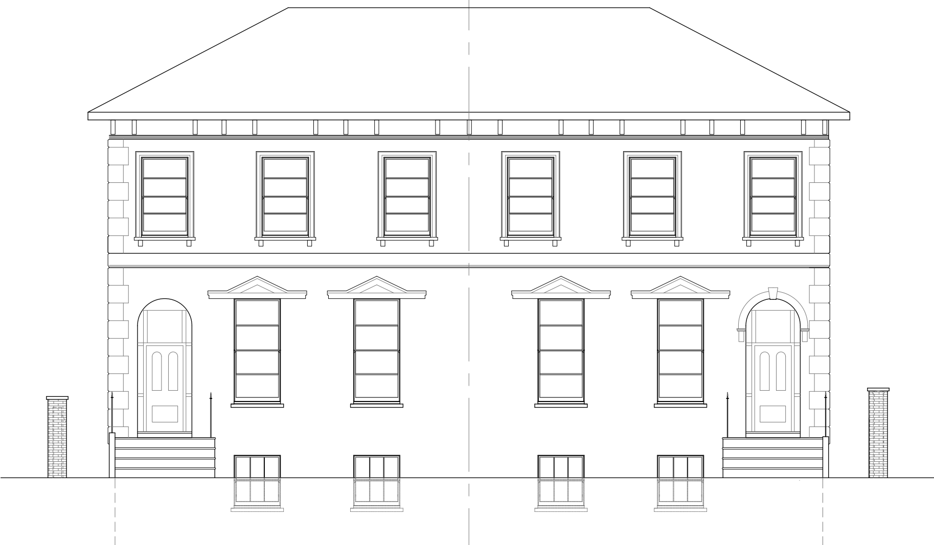
EXISTING FRONT ELEVATION (1:100)