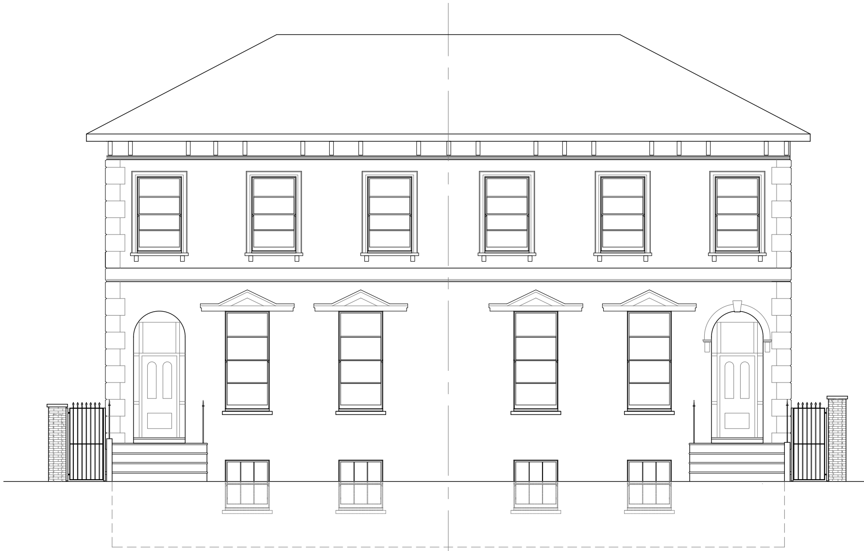
PROPOSED FRONT ELEVATION (1:100)