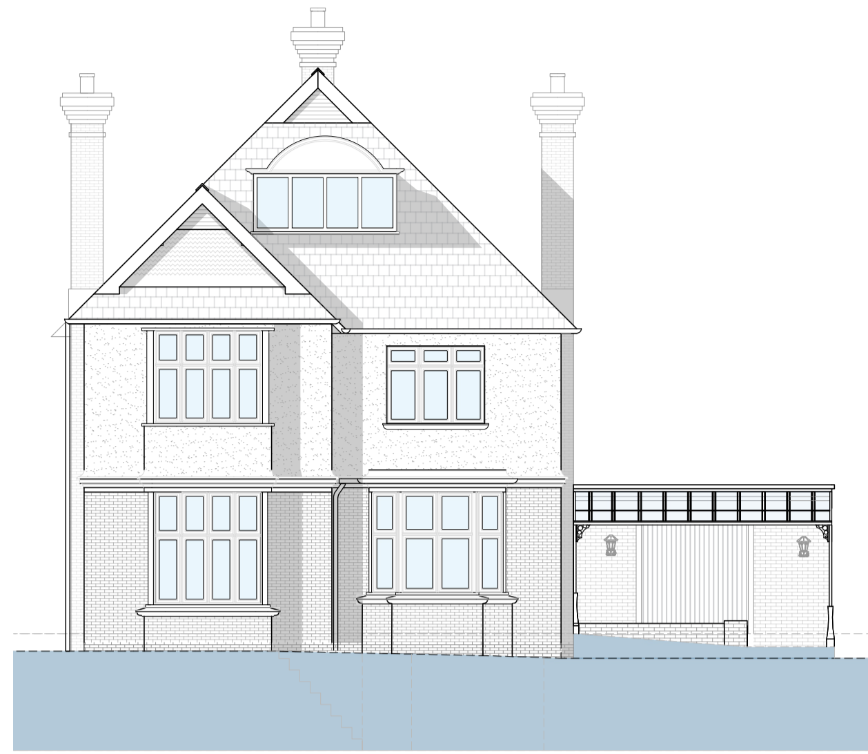
Front Elevation at 1:100 Scale