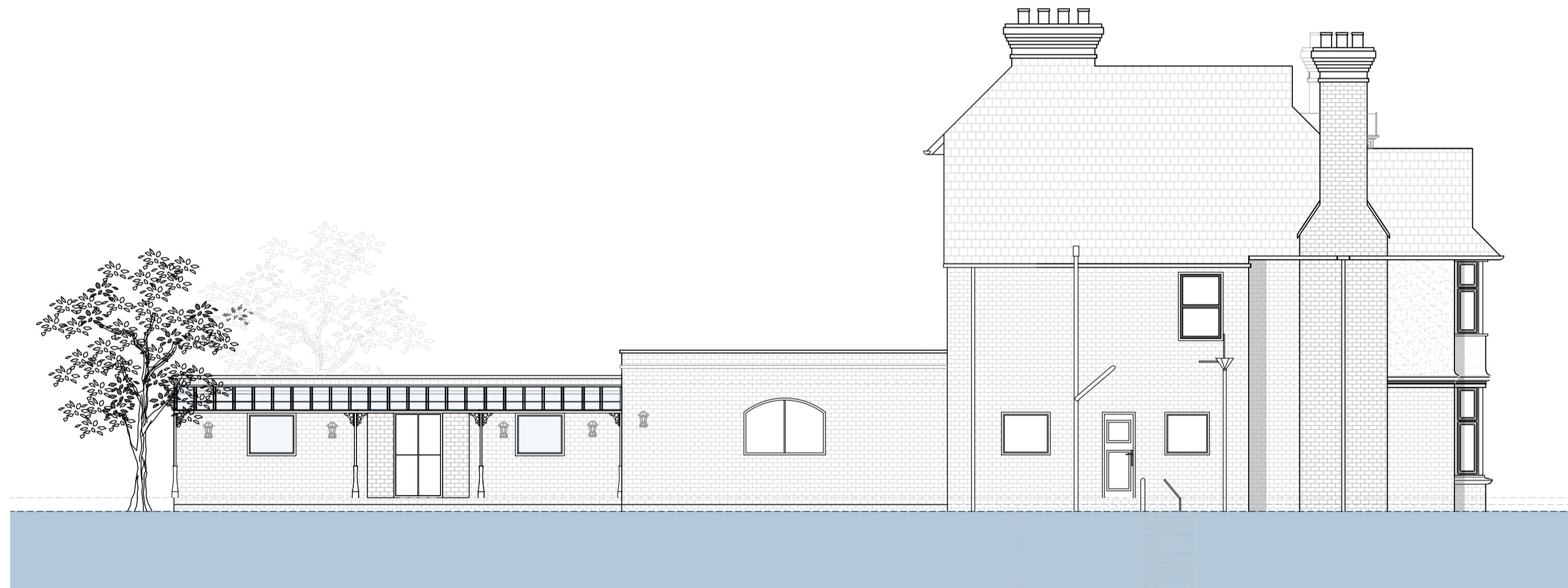
Side Elevation at 1:100 Scale

Ordnance Survey (c) Crown Copyright 2023. All rights reserved. Licence number 100022432