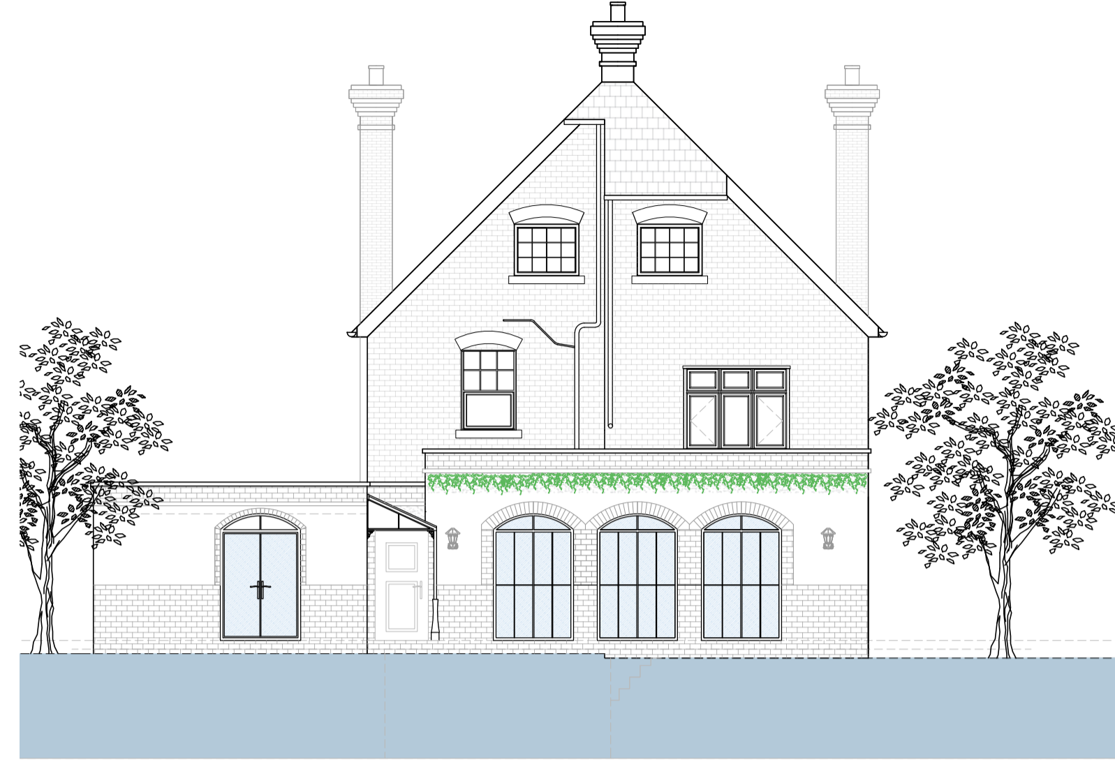
Front Elevation at 1:100 Scale