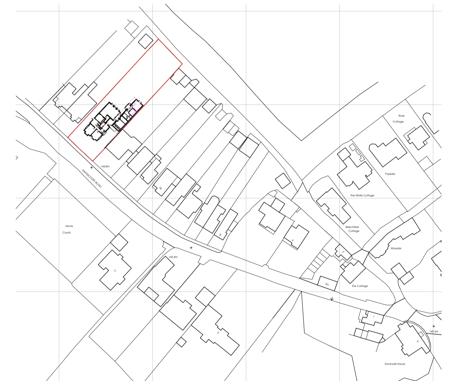
Location Plan at 1:1250 Scale

Ordnance Survey (c) Crown Copyright 2023. All rights reserved. Licence number 100022432