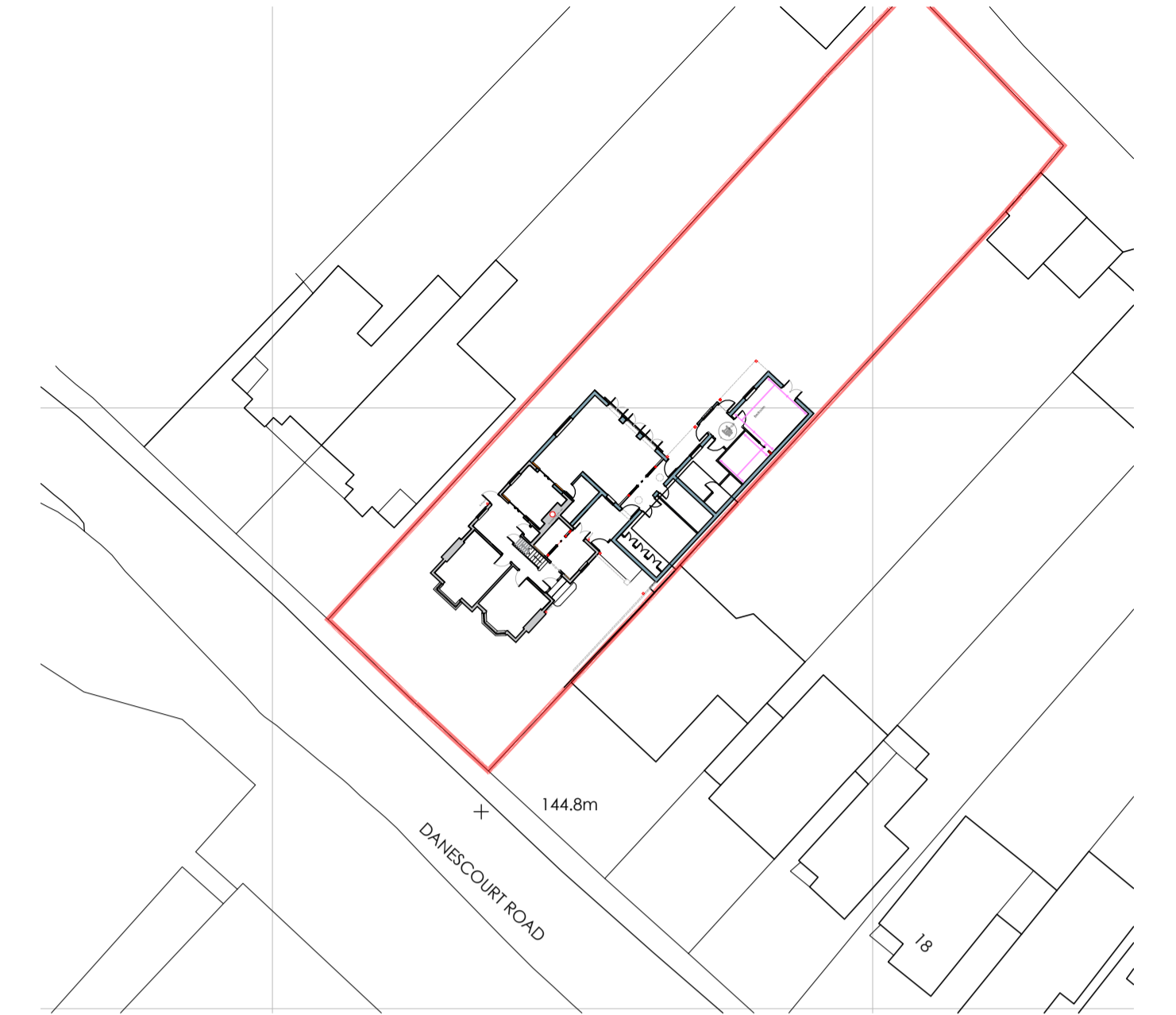
Block Plan at 1:500 Scale

Ordnance Survey (c) Crown Copyright 2023. All rights reserved. Licence number 100022432