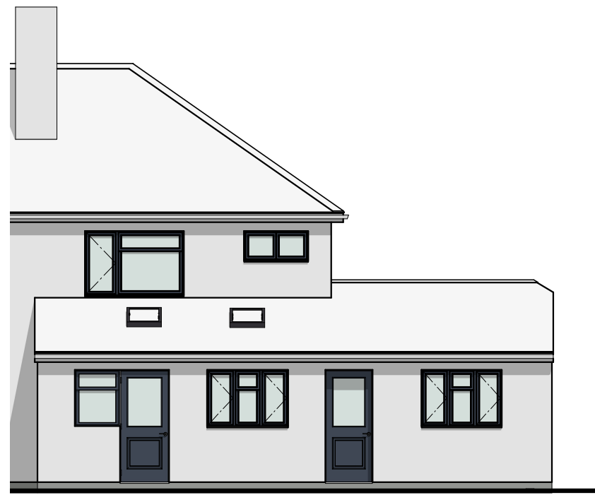
Rear Elevation Scale 1:100 0 4m