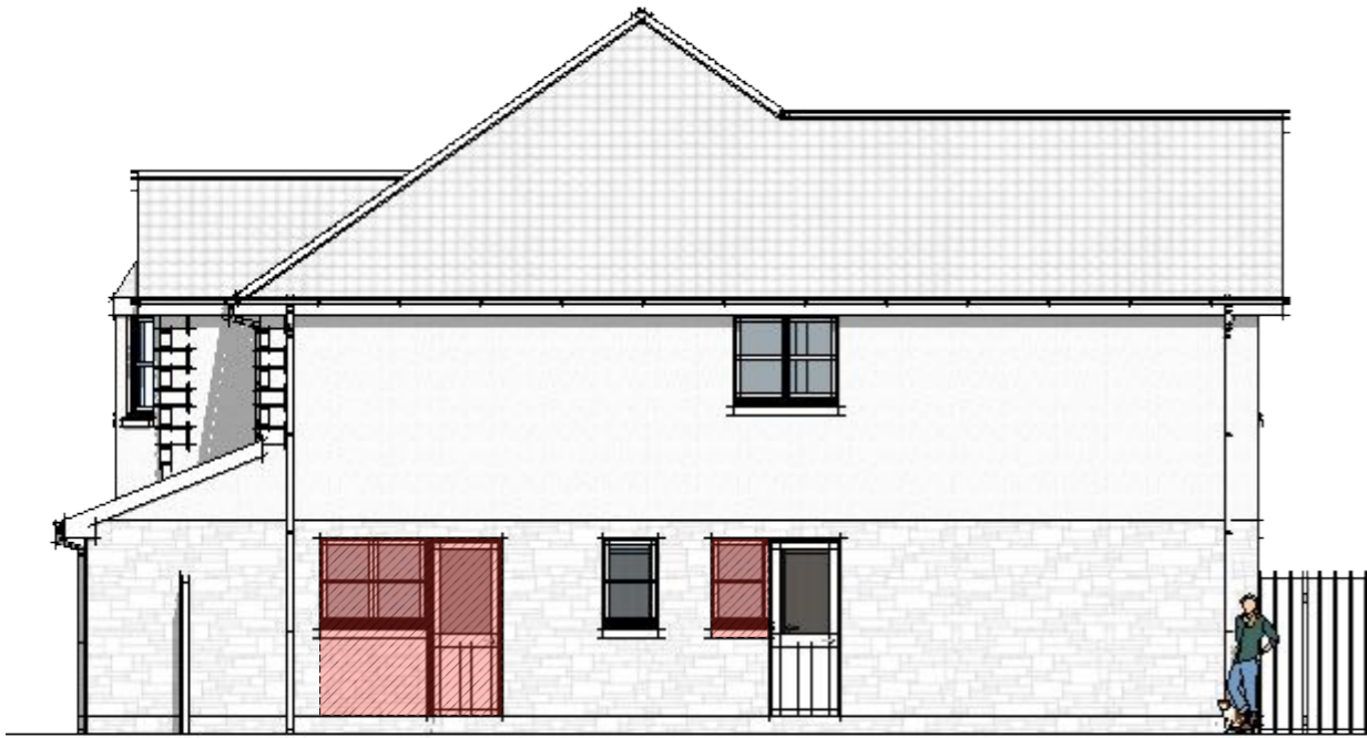
E :: EXISTING SIDE ELEVATION 2 scale: 1:100