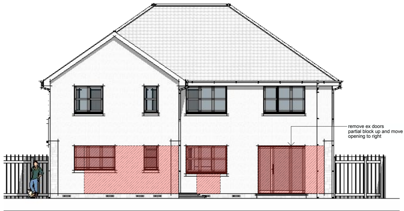
E :: EXISTING REAR ELEVATION 2 scale: 1:100