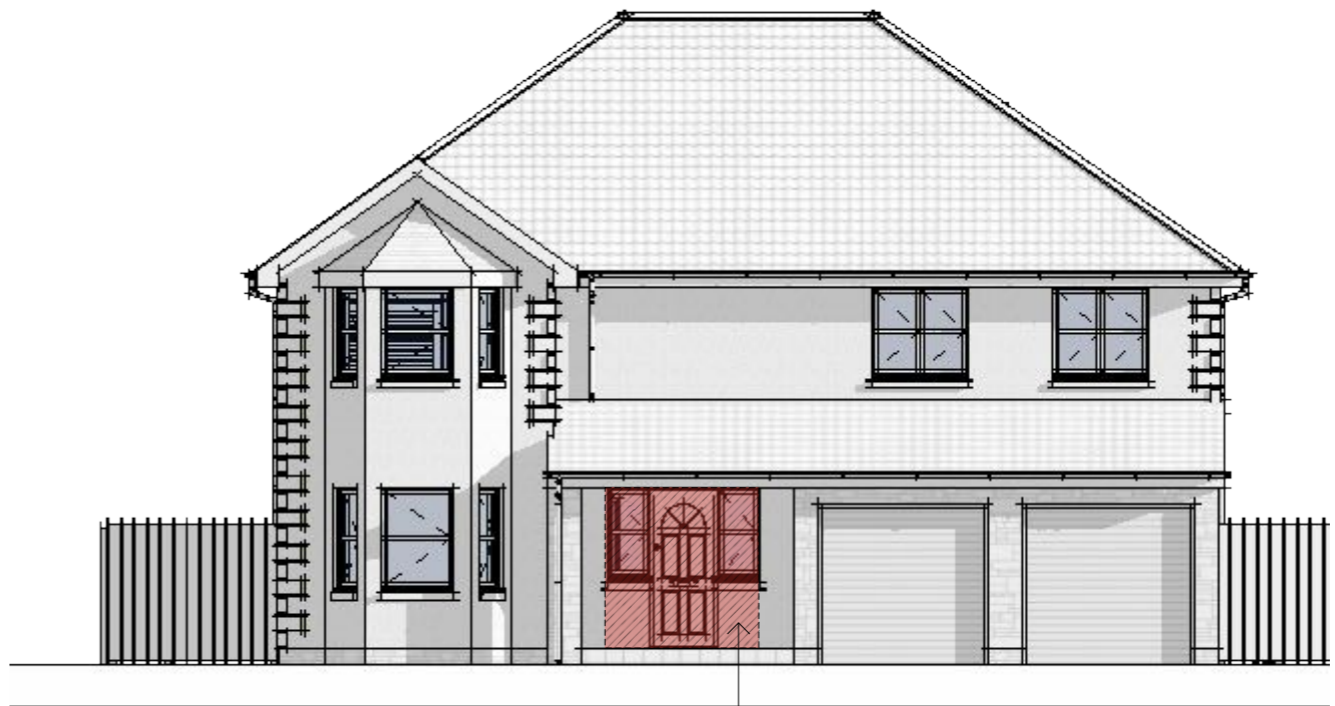
E :: EXISTING FRONT ELEVATION 2 scale: 1:100