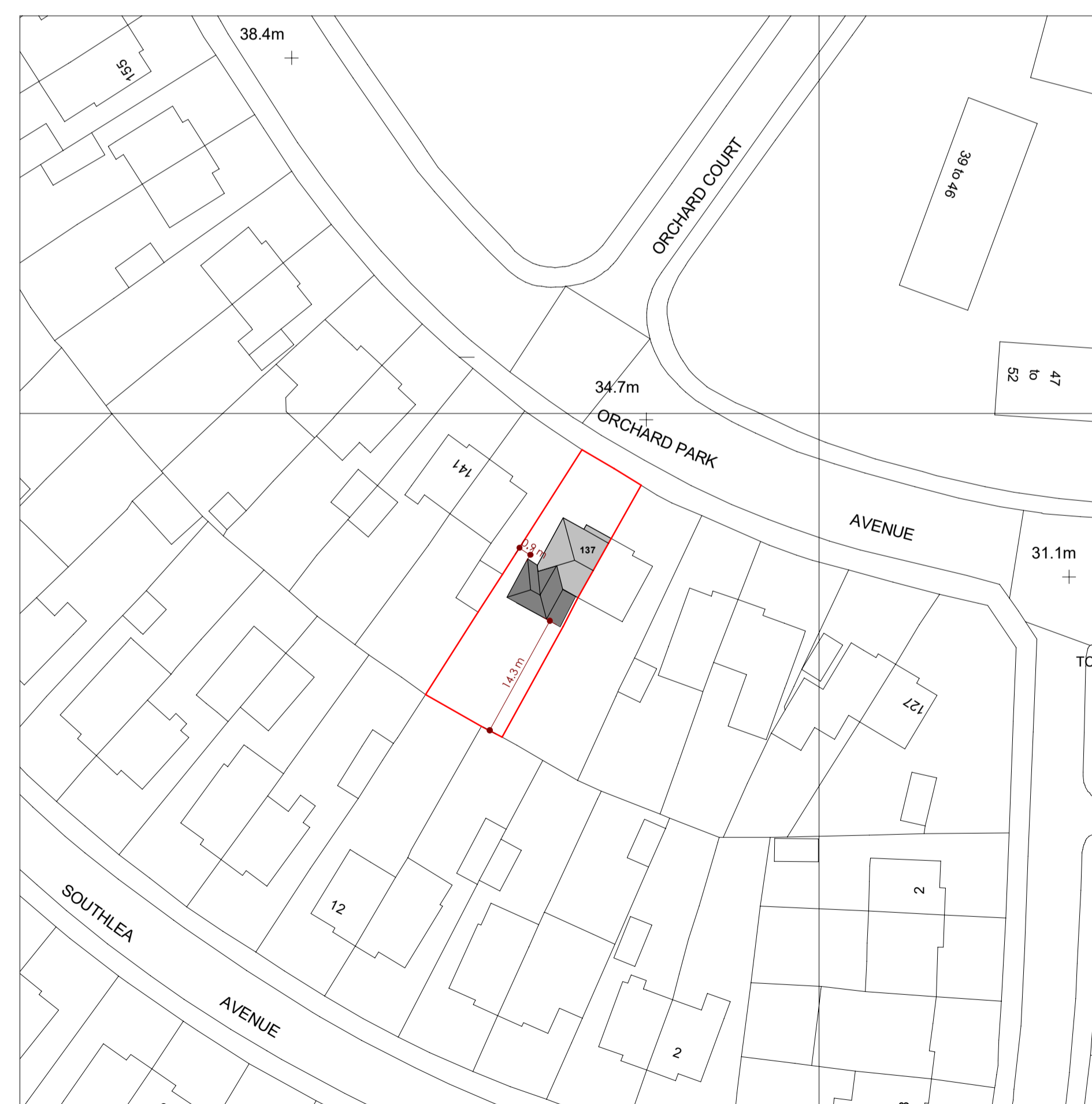
Site Plan - Proposed 1 : 500