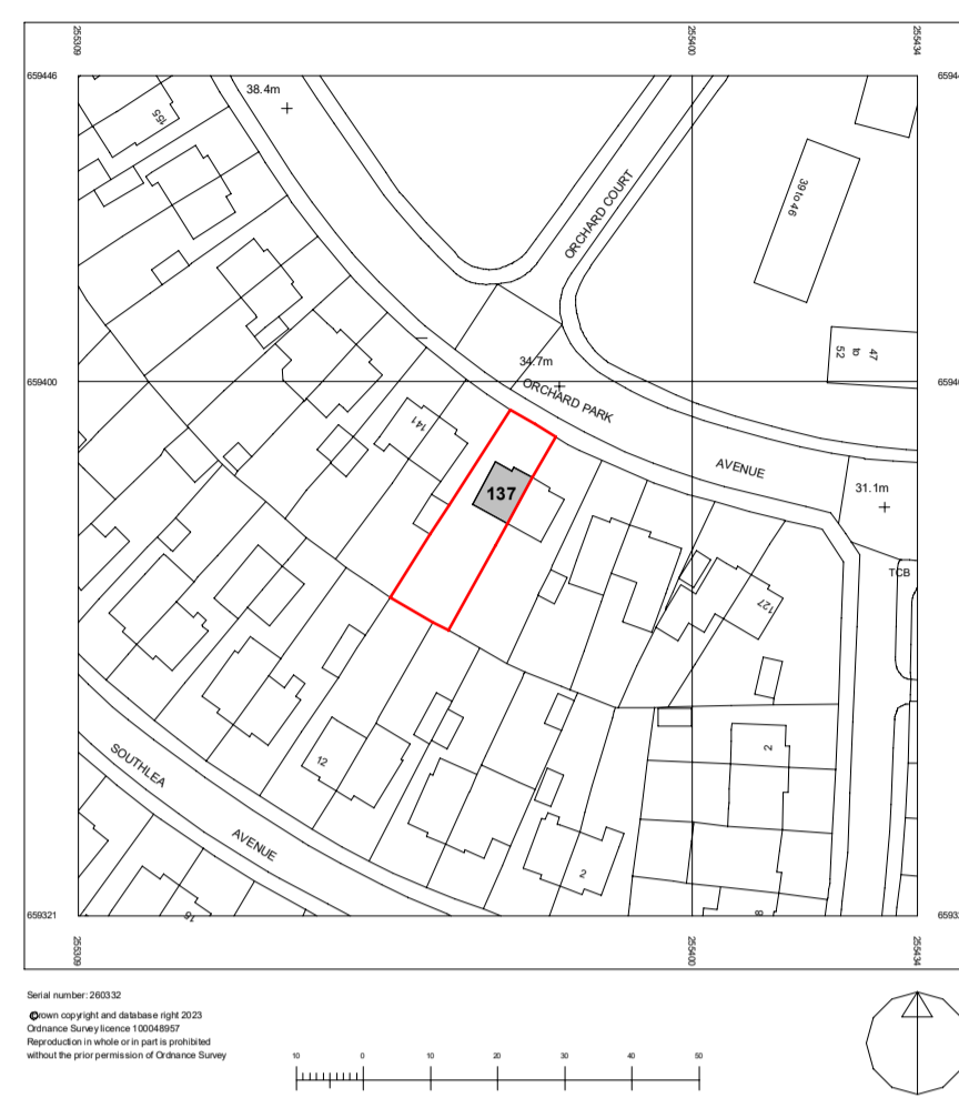
Location Plan 1 : 1250