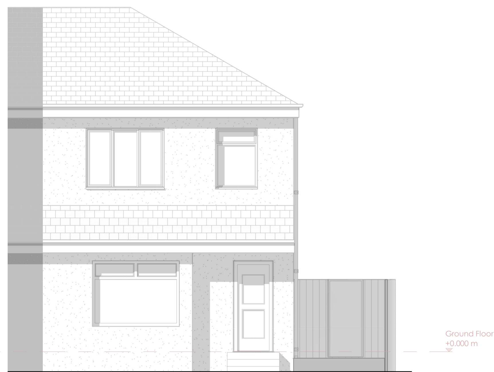
Existing Front Elevation 1 : 50