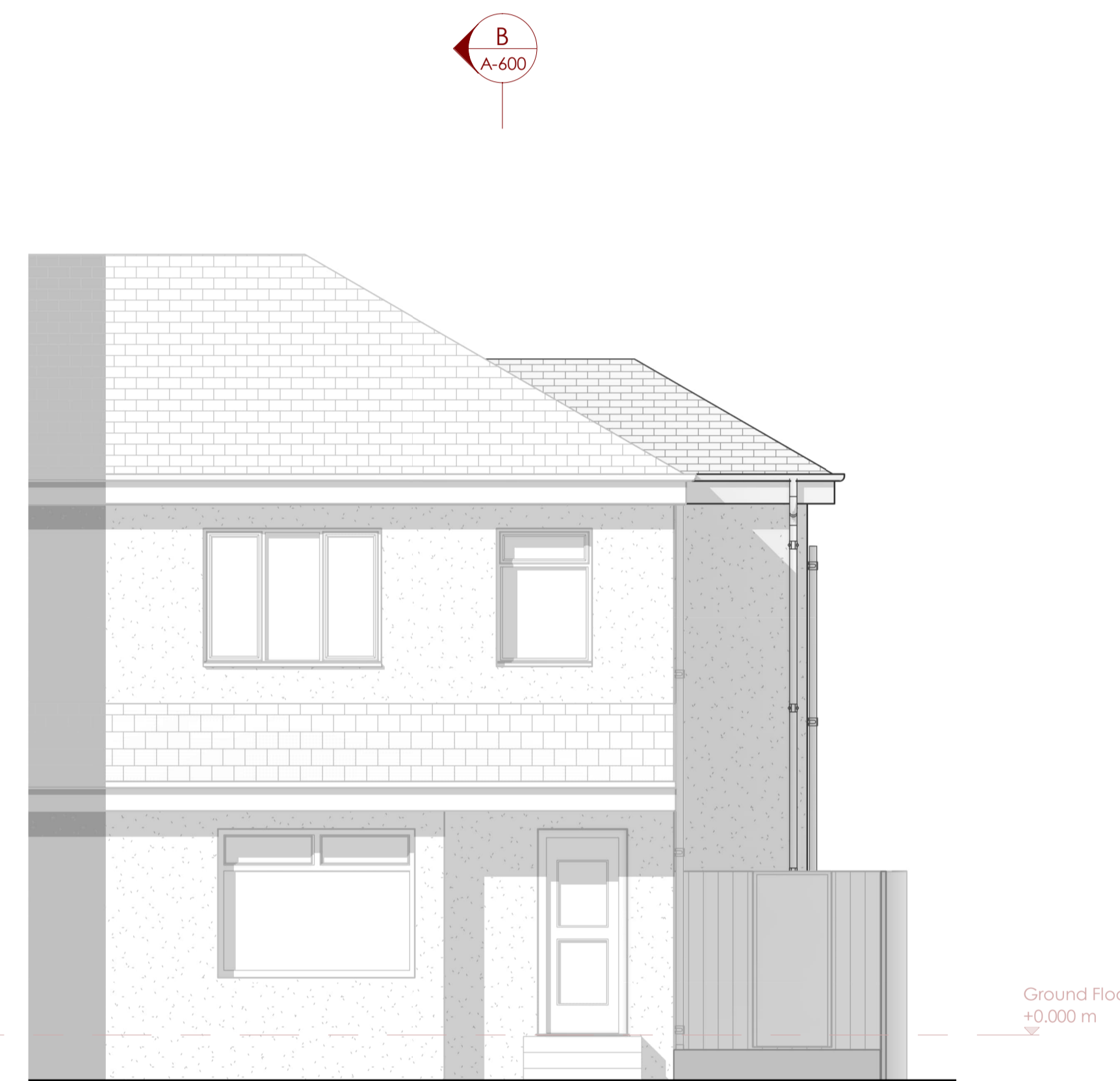
Proposed Front Elevation 1 : 50