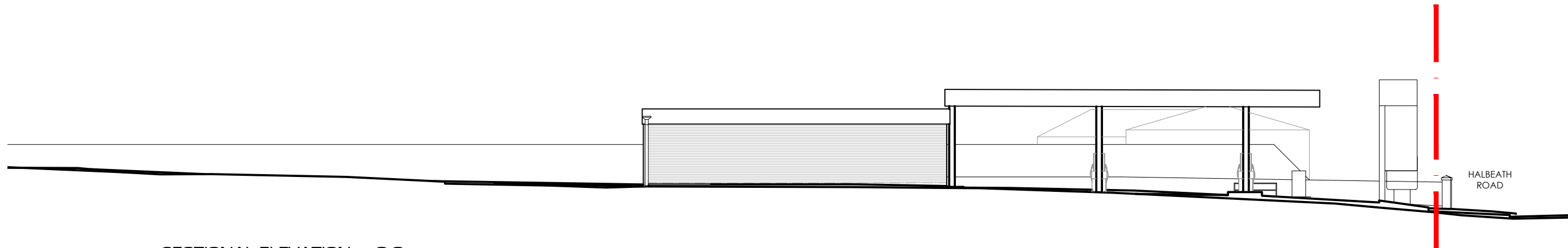
SECTIONAL ELEVATION G-G