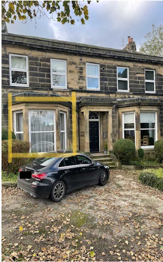
Image 1 Current front window single glazed timber frame. Proposal to replace with window frame of identical design (doubled glazed made of hardwood and painted white)