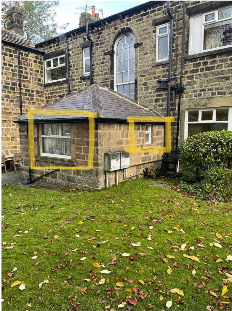
Image 3 and 4 (below) showing 5 windows to rear of Flat 1 currently timber single glazed. Proposal to upgrade to UPVC double glazed in style consistent with first floor windows (currently UPVC double glazing).