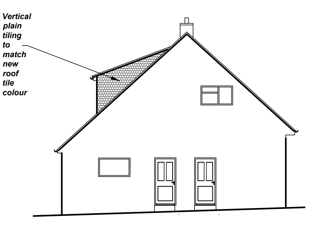
PROPOSED SOUTH EAST ELEVATION Scale 1:100