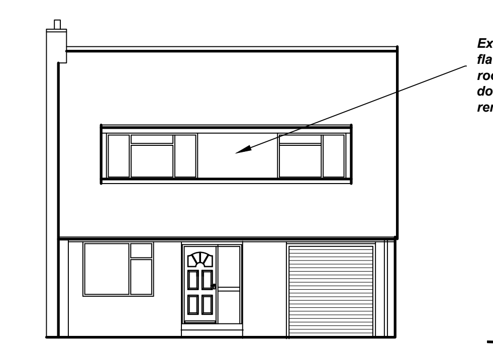
EXISTING SOUTH WEST Scale 1:100 ELEVATION