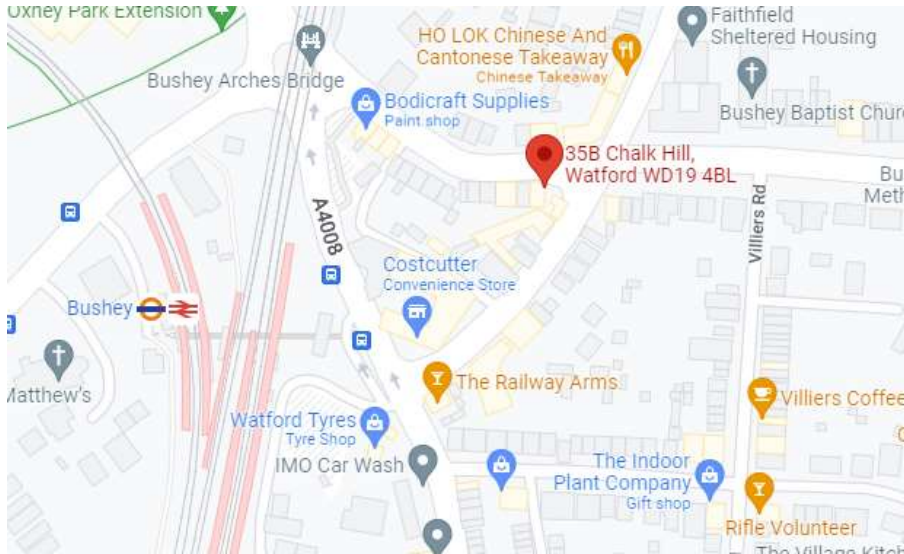
Railway Line Close to the development

The property 35B Chalk Hill sits in the centre of Chalk Hill and Aldenham Road in Bushey. The site is located 225m east of Bushey Train Station, with direct links into London and the North.